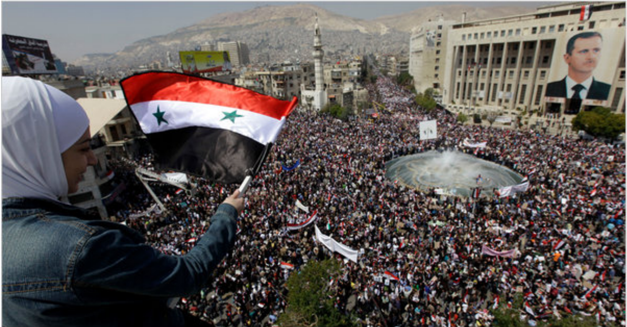
Tens of thousands march in support of the Syrian Government.

You saw many protests against Bashar Al Assad yet you failed to see the overwhelming marches in support of the government and the proposed reforms, these marches filled the streets of Damascus, Aleppo and Tartous but you didnt see them. You have highlighted the macabre accounts of the government victims but failed to report those of the victims of the armed opposition. In your eyes, there are good and bad victims. There are victims that you talk about and those you dont want to hear about. You have deliberately chosen to see one side and ignore the other.