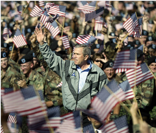
Bush addressing 25,000 military 2005

Iraqi precedent and the unforgettable lies from the Bush era.