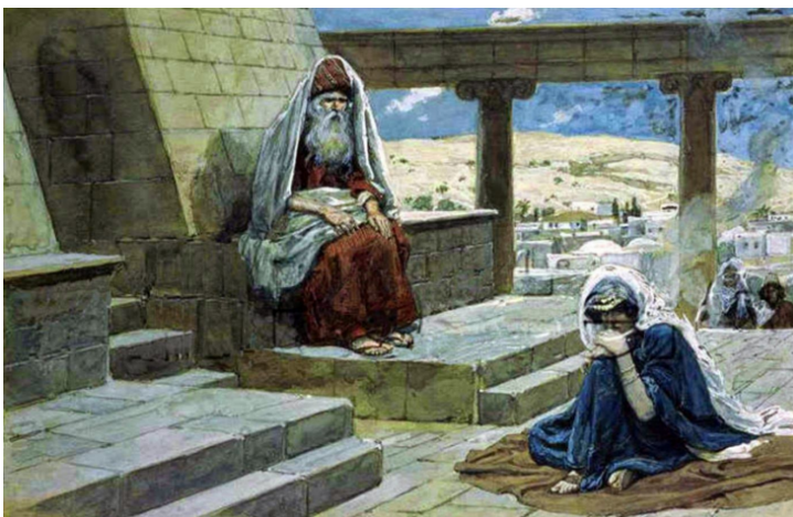
Image: Eli watching Hannah pray to God for a child at the Tabernacle in Shiloh

The Book of Samuel, in the Old Testament, lays out the story of Samuel's birth and how he found himself in the service of Eli in riveting detail. There is one problem, however—it is a false narrative.