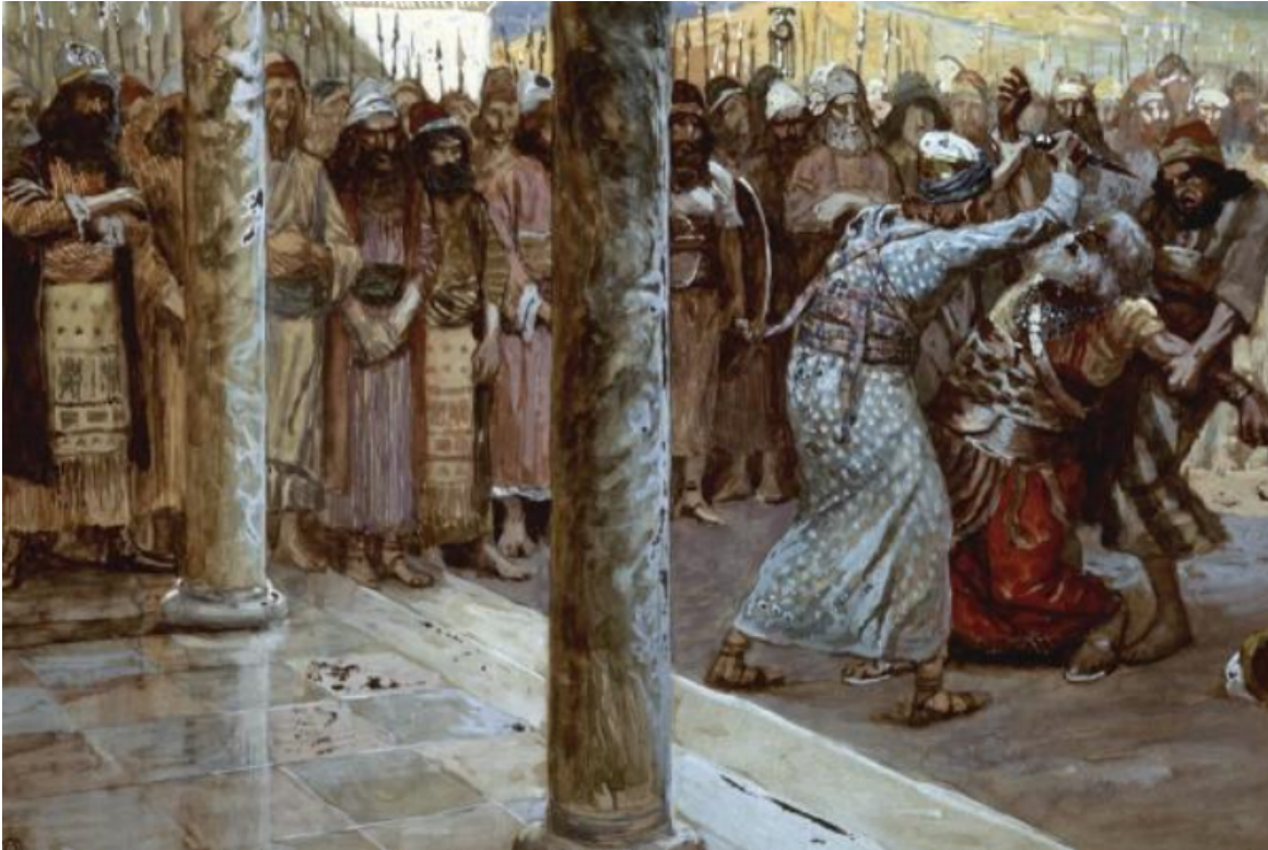
Samuel slays King Agag

There is a postscript to the story of Amalek.