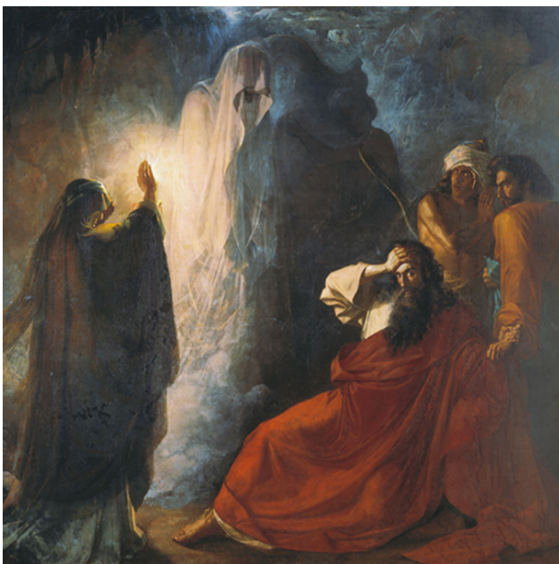
Image: The Witch of Endor summons the ghost of Samuel at the request of Saul

But heaven cannot be violated by the incantations of a witch; the spirit the witch of Endor summoned was not of God, but rather from Satan, a demon—suggesting that Samuel, like Eli before him, had been a servant of the Devil from the start.