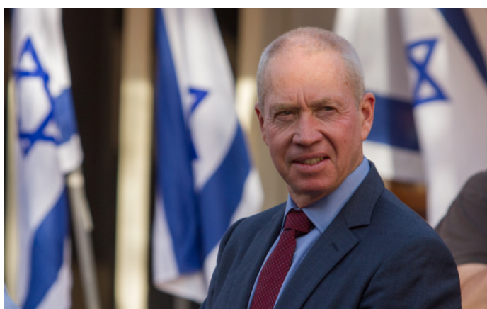
Image: Yoav Gallant, the Israeli Minister of Defense

Shortly after the Hamas attack on Israel on October 7, 2023, the Israeli Minister of Defense, Yoav Gallant, has likened the modern-day “seed of Amalek” (the citizens of Gaza) to animals. “[Israel is] imposing a complete siege on Gaza,” Gallant said. “No electricity, no food, no water, no fuel. Everything is closed. We are fighting human animals, and we are acting accordingly.”