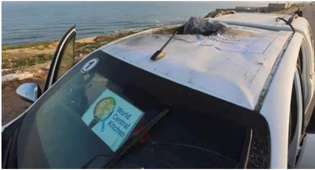
Image: A destroyed World Central Kitchen vehicle in Gaza.

To help combat the scourge of starvation, celebrity chef Jose Andres dispatched members of his non-governmental organization, World Central Kitchen (WCK) to Gaza, where they established two main kitchens—one in the southern city of Rafah and another in the central town of Deir al-Balah, which served more than 170,000 hot meals daily to Palestinians. Up until April 1, 2024, WCK had provided over 43 million meals to the starving citizens of Gaza.