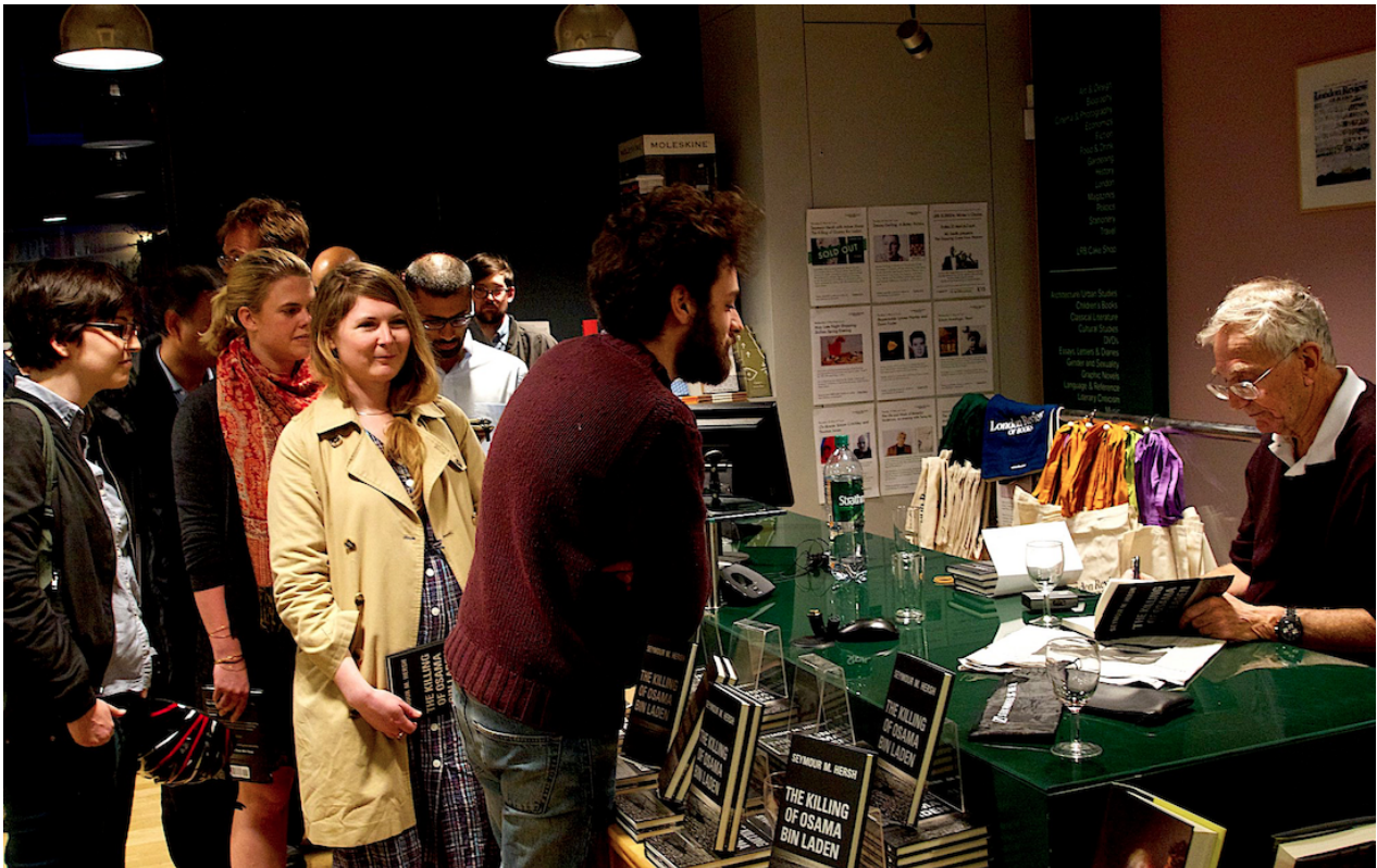
Seymour Hersh signing books at the London Review of Books bookshop, April 2016.

Which is why none of them challenged the equally mad claims that Russia was repeatedly shelling its own forces occupying the Zaporizhzhia nuclear power station. It's also why none of them challenged the utterly risible official version of the Skripal story.