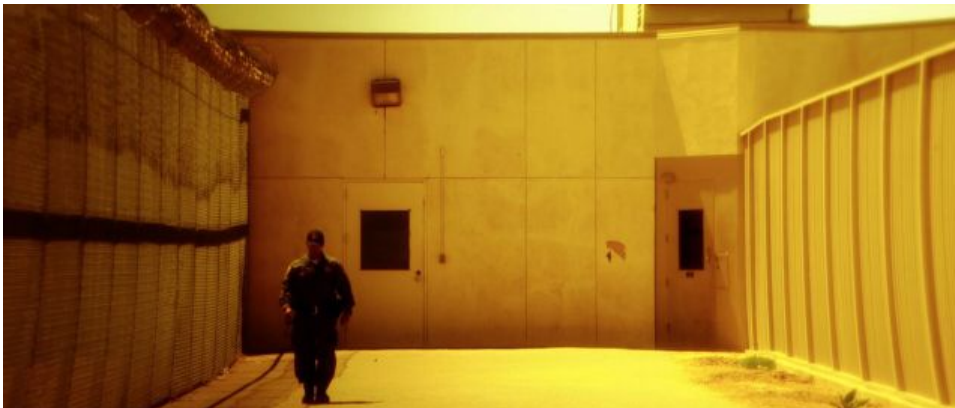
Survivors Guide to Prison

Survivors Guide acknowledges that “if you’re rich and guilty you have a much better chance than if you’re poor and innocent.”