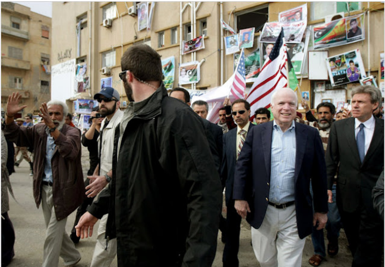
Image: Bi-partisan treason. Senator John McCain pictured alongside the now deceased

The purpose of the attacks was to reestablish an adversarial narrative between the US and regional sectarian extremists after a surge in public awareness that the two have been working in tandem against the enemies of the West for years. The US itself would implicate "Al Qaeda" as being behind the regional attacks for this very purpose, before continuing their support of the terror organization in its efforts to overrun Syria.