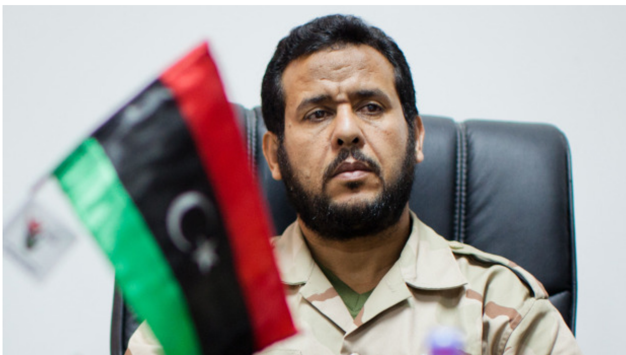
Photo: The face of Libya's "revolution" was literally Al Qaeda. Al Qaeda's LIFG commander, Abdul Hakim Belhadj, was NATO's point man in Libya and has now redirected his terrorist forces against Syria. LIFG commanders are now literally running entire brigades in Syria with Western diplomatic, logistic, and military support.

Abdulkhkim Belhadj, head of the Tripoli Military Council and the former leader of the Libyan Islamic Fighting Group, "met with Free Syrian Army leaders in Istanbul and on the border with Turkey," said a military official working with Mr Belhadj. "Mustafa Abdul Jalil (the interim Libyan president) sent him there."