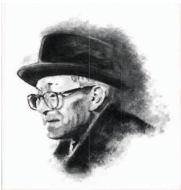
James Jesus Angleton, head of counterintelligence and "CIA's answer to the Delphic Oracle" from 1954-1974.

Various works on intelligence have noted both the past competition and present cooperation between the CIA and National Security Agency. 7 In "A Brave, New World" ( Document 14 ), the author states that the CIA and NSA "are moving their strategic partnership beyond the optional cooperation of the past into a new era of collaboration," and notes that the Director of Central Intelligence – George J. Tenet at the time – had viewed much of the success against al-Qaeda and its allies as the "direct result of CIA and NSA working together."