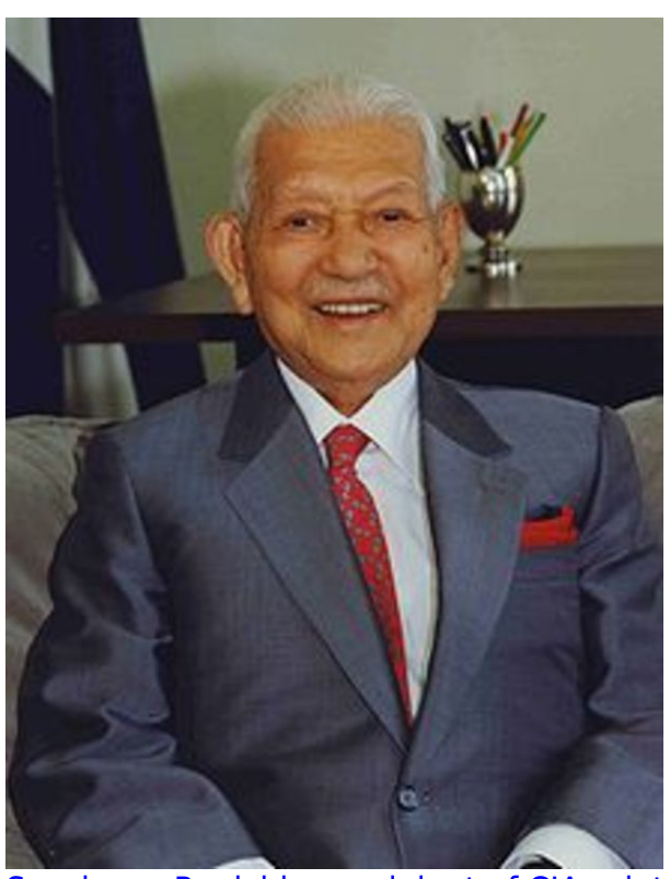
Sasakawa Ryoichi: a recipient of CIA-related Lockheed payments, who boasted of his involvement in Indonesia's regime change

Fact No. 4) In May 1965, months before the September coup, CIA-related Lockheed payments shifted from a Sukarno backer to a Suharto backer.<sup>6</sup>