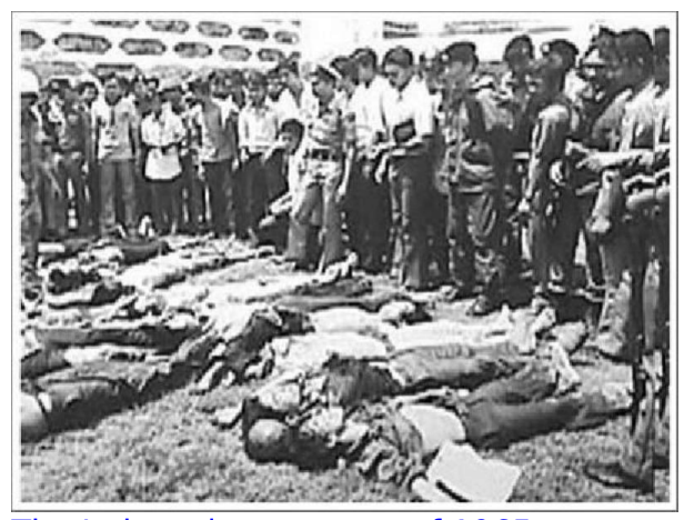
The Indonesia massacre of 1965

Strikingly, there has been very little follow-up investigating these events inside the United States. A new generation of scholars, notably John Roosa and Bradley Simpson, have documented U.S. involvement in the exploitation of Gestapu to justify the subsequent mass murder, in the massacre project itself, and in the formation of the subsequent capitalist New Order. But there has been, I shall try to show, little or no American response to facts I presented then suggesting U.S. involvement in inciting the specific event of September 30 itself.