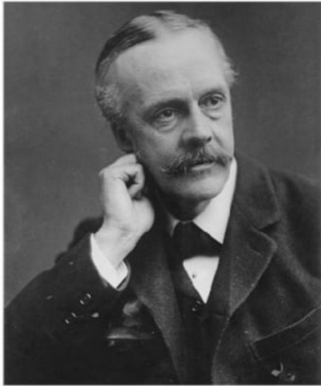
Arthur James Balfour (1848-1930)