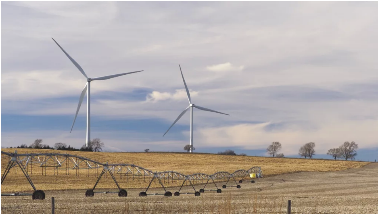
A center pivot near Gates' land in Antelope County, Nebraska. The billionaire owns land in 19 Nebraska counties.

Gaining access to groundwater is often a priority for potential farmland buyers. If you own land in Nebraska, you have the possibility of accessing the underlying groundwater, but natural resource districts regulate how water is used.