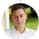
Albert Bourla ✓