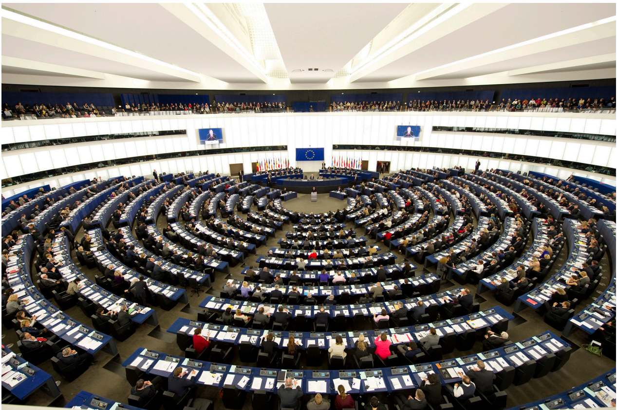
European Parliament in Strasbourg, France.

The European Parliament, obsessed with virtue signaling in regard to human rights, was particularly receptive to the zealous anti-totalitarianism of its new Eastern European members.