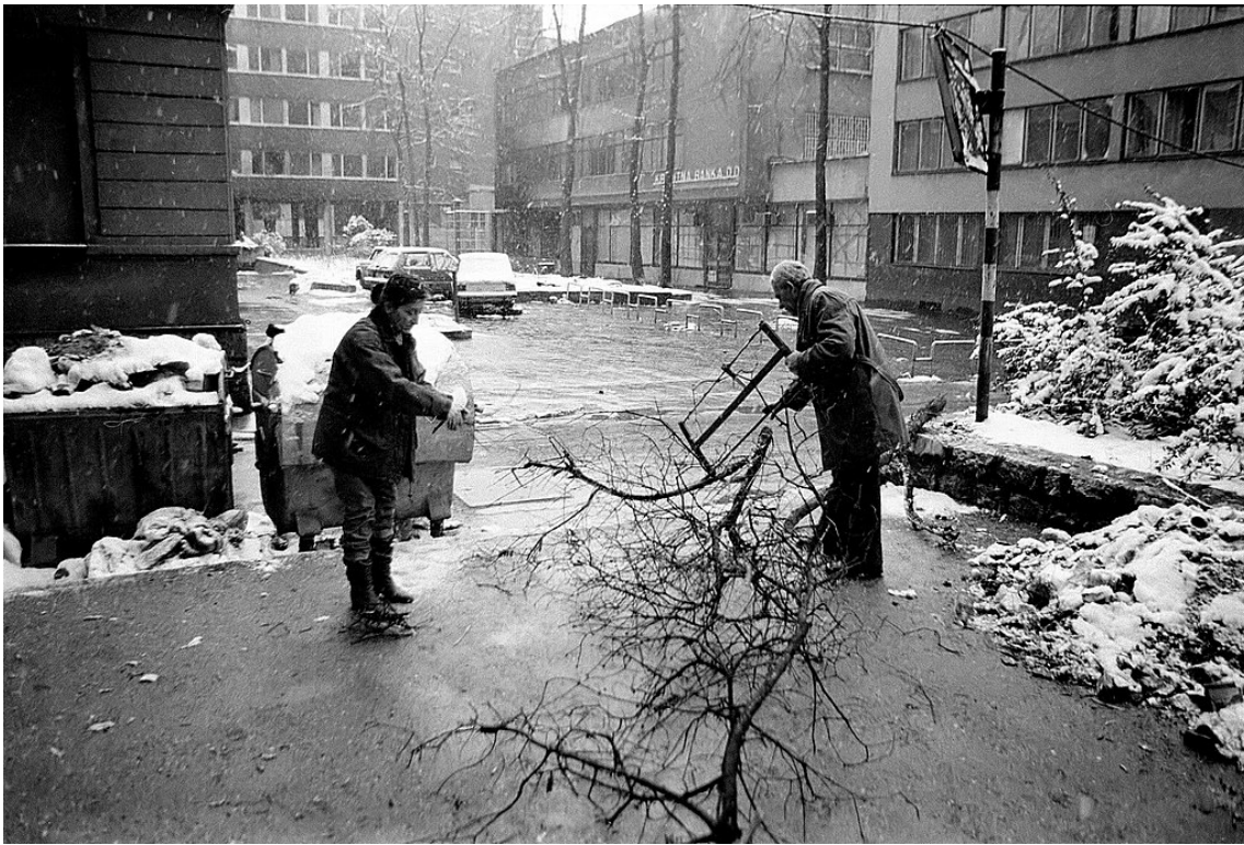
Cutting firewood in Sarajevo during wars that broke up Yugoslavia, 1993.

This process began in the 1990s, with the breakup of Yugoslavia.