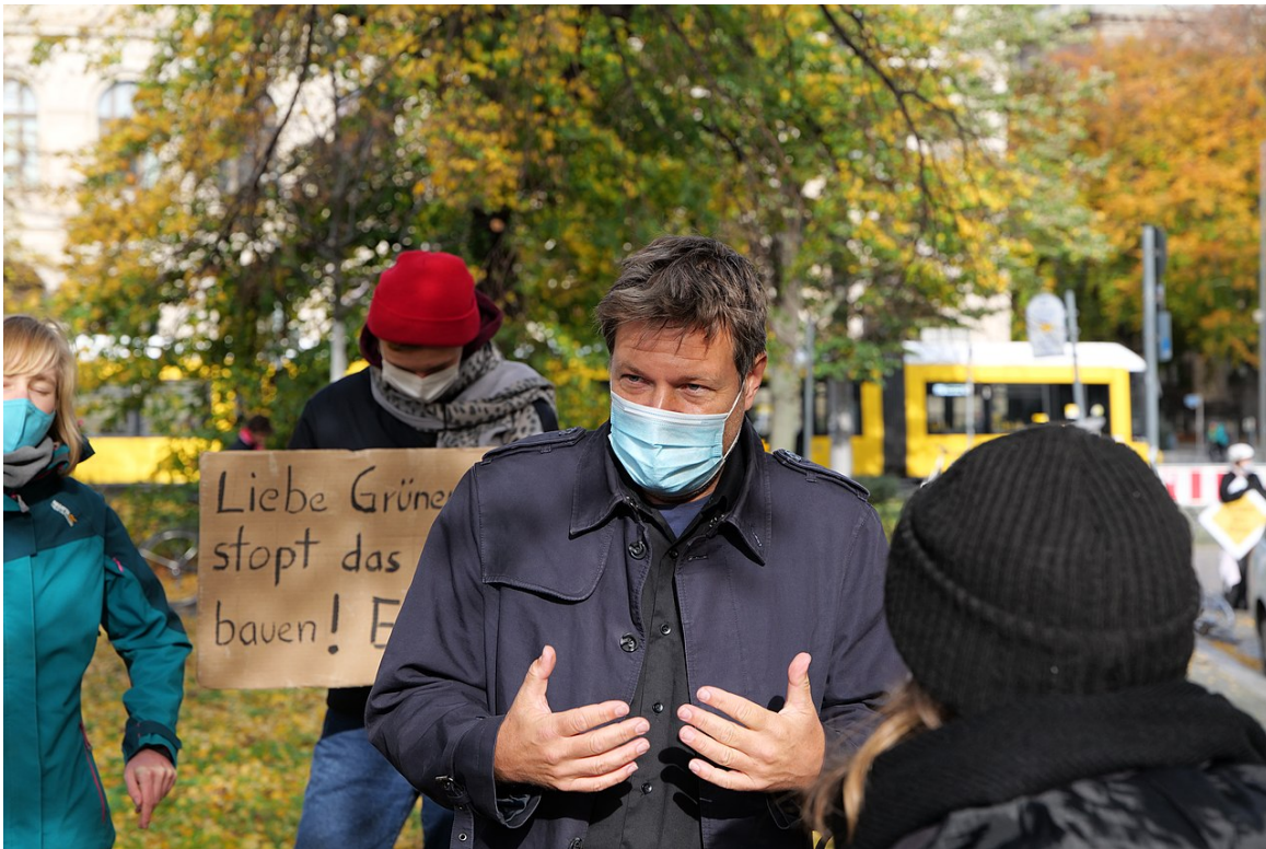
Robert Habeck speaking at protest before Green Party headquarters, Berlin, Oct. 28, 2020.

In short, Germany's military buildup will give substance to Robert Habeck's notorious statement in Washington last March that: "The stronger Germany serves, the greater its role." The Green's Habeck is Germany's economics minister and the second most powerful figure in Germany's current government.