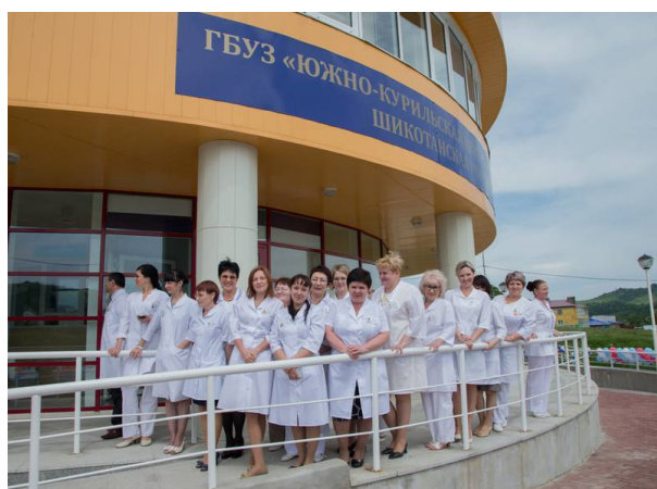
New hospital on Shikotan ( Source )