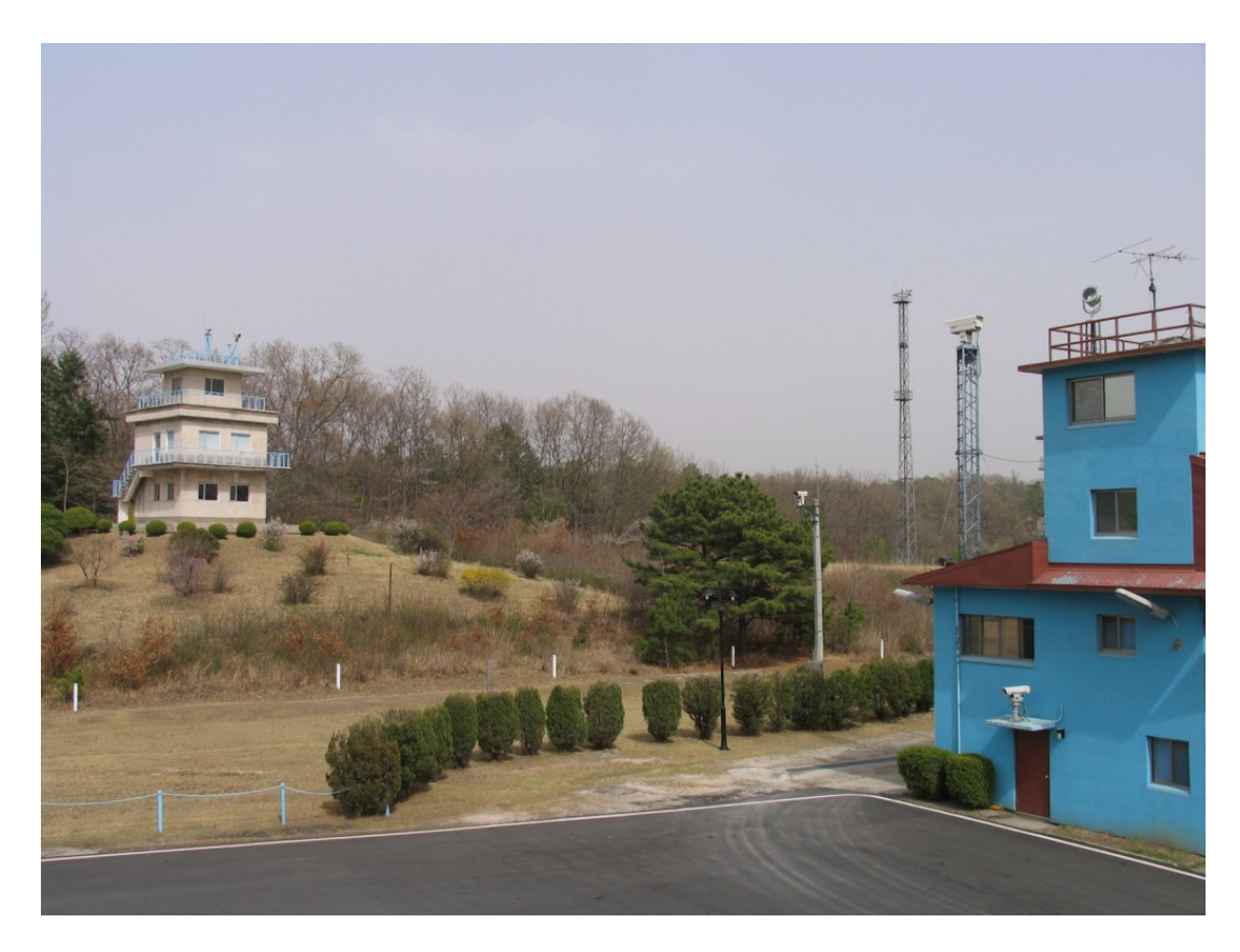
The most fortified border on earth - between North and South Koreas

If you are a connoisseur, the "Korean Veterans Association" arranges the 'most enjoyable' visits in conjunction with Chung-Ang Express Tour. Guides are nothing less than former South Korean soldiers and intelligence officers; just what those who are always willing to sample delicious nuances and tastes of pro-market and pro-western brainwashing process truly appreciate!