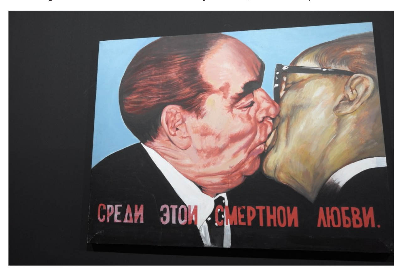
ROK-German propaganda art

By then we were inside the multi-story exhibition venue. It was a truly monstrous place: lowest grade of propaganda kitsch! There were paintings of Brezhnev French-kissing Erich Honecker, as well as some sentimental outpourings about freedom, democracy, and peace... Anti-Communist barks were intertwining with pro-Western, pro-American 'artwork'. There were images of both the Berlin Wall and Marilyn Monroe, on the same panel.