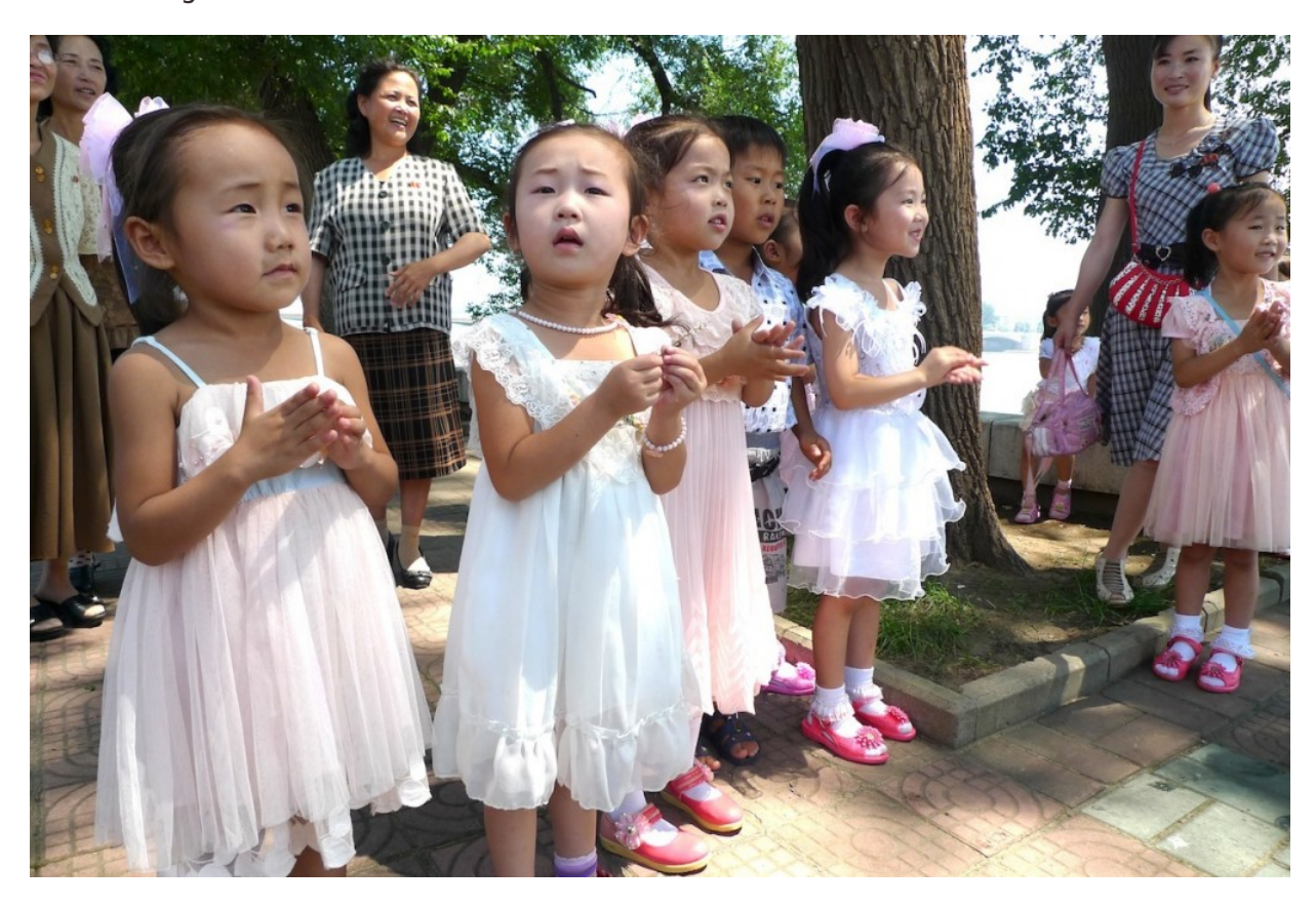
North Korean kids on the street

In the morning I put on sharp looking black pants, trimmed my beard, and charged my cameras. After examining my reflection in the mirror I came to the conclusion that despite some shortcomings in my appearance beyond my control, I looked fit to represent the affluent world of 'democracy, freedom and economic opportunities'. My inner thoughts remained well hidden and unless someone were to force me to undergo a lie-detector test, there was hardly any danger that my presence at the most militarized frontier in the world would cost disturbances or embarrassment to my South Korean hosts. Armed with my notebooks, cameras and US passport, I left the hotel, in anticipation of yet another surreal undertaking.