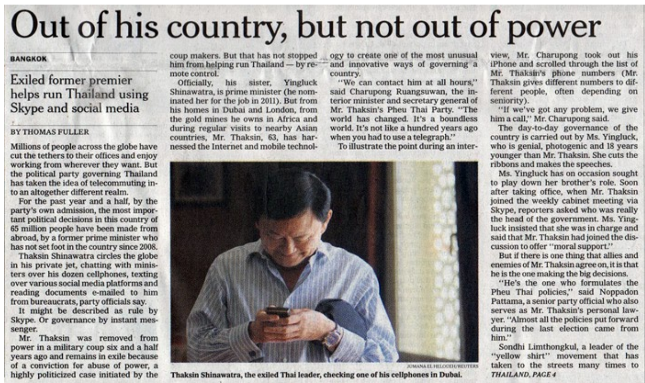
Image: The New York Times openly admits that Thailand is currently run by unelected convicted criminal/fugitive Thaksin Shinawatra. Clearly any proxy government or elections in which it participates in are illegitimate by both Thai and international standards. Thaksin’s foreign ties are what have afforded him impunity regarding an otherwise cartoonish, 3rd world dictatorship.