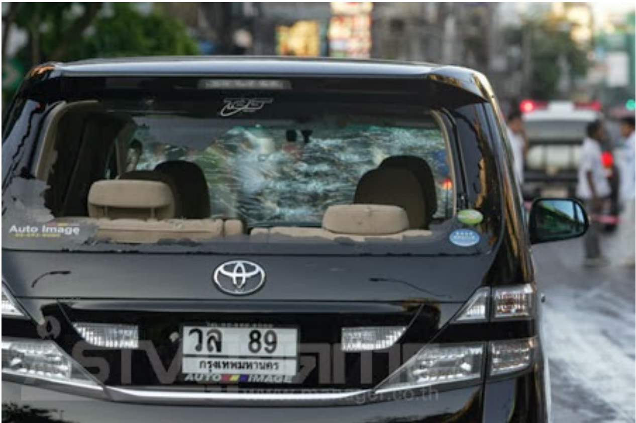
Image: Anti-Thaksin activist, protest leader, and media mogul Sondhi Limthongkul's van after being shot at by over 100 rounds in a failed assassination attempt carried out in broad daylight in 2009. Sondhi is just one of many of Thaksin Shinawatra's enemies that have faced assassination.