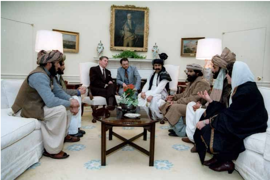
Ronald Reagan meets Afghan Mujahideen Commanders at the White House in 1985