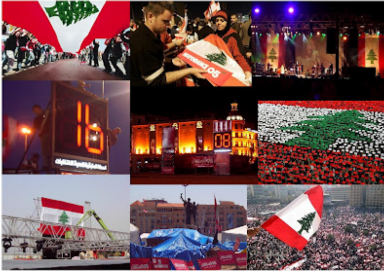
“As illustrated by the images above, Lebanon’s so-called [2005] Cedar Revolution was an expensive, highly-professional production.” (click image to enlarge)