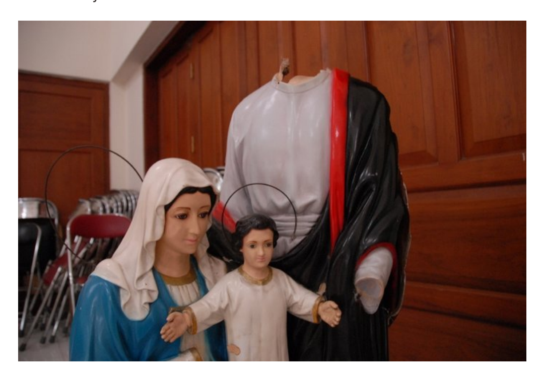
Extremist attacks against Indonesian churches

Afghanistan, Iran (prior to the coup of 1953), Iraq and Libya before they were thoroughly and brutally smashed.