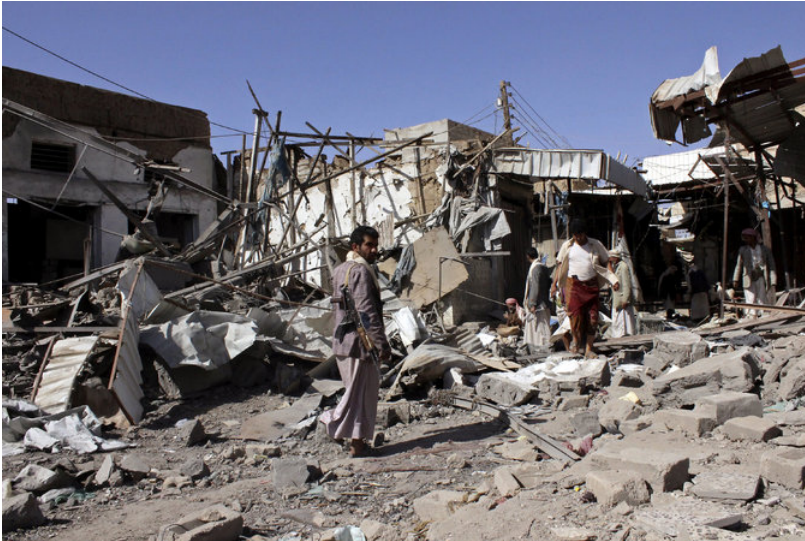
'Death from Above' – Another air raid conducted following Saudi Arabia's ceasefire reversal last week.