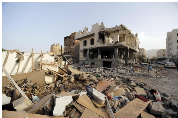
'Striking Yemen' – Saudi air raids destroy part of a neighborhood in Sana'a, Yemen, on April 26, 2015.

Although it's been just over month since the aggressive bombing campaign began, the US along with other Gulf Cooperation Council (GCC) allies, are still openly supporting the asymmetrical proxy war that is tearing Yemen apart.