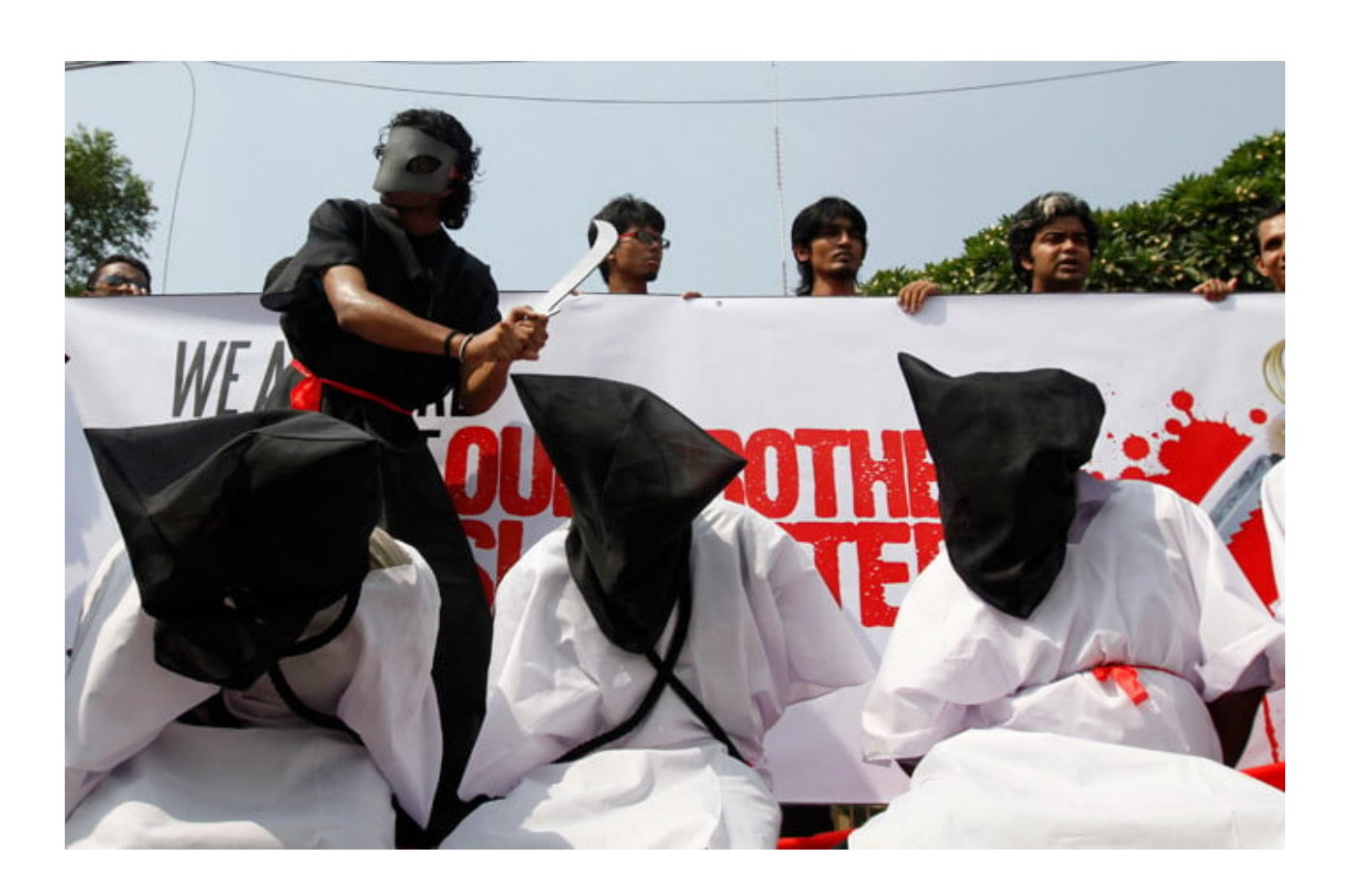
Members of Magic Movement, a group of young Bangladeshis, stage a mock execution scene in protest of Saudi Arabia beheading of eight Bangladeshi workers in front of National Museum in Dhaka

RT: How do you see this recent horrible "blogger" case? What was the US reaction?