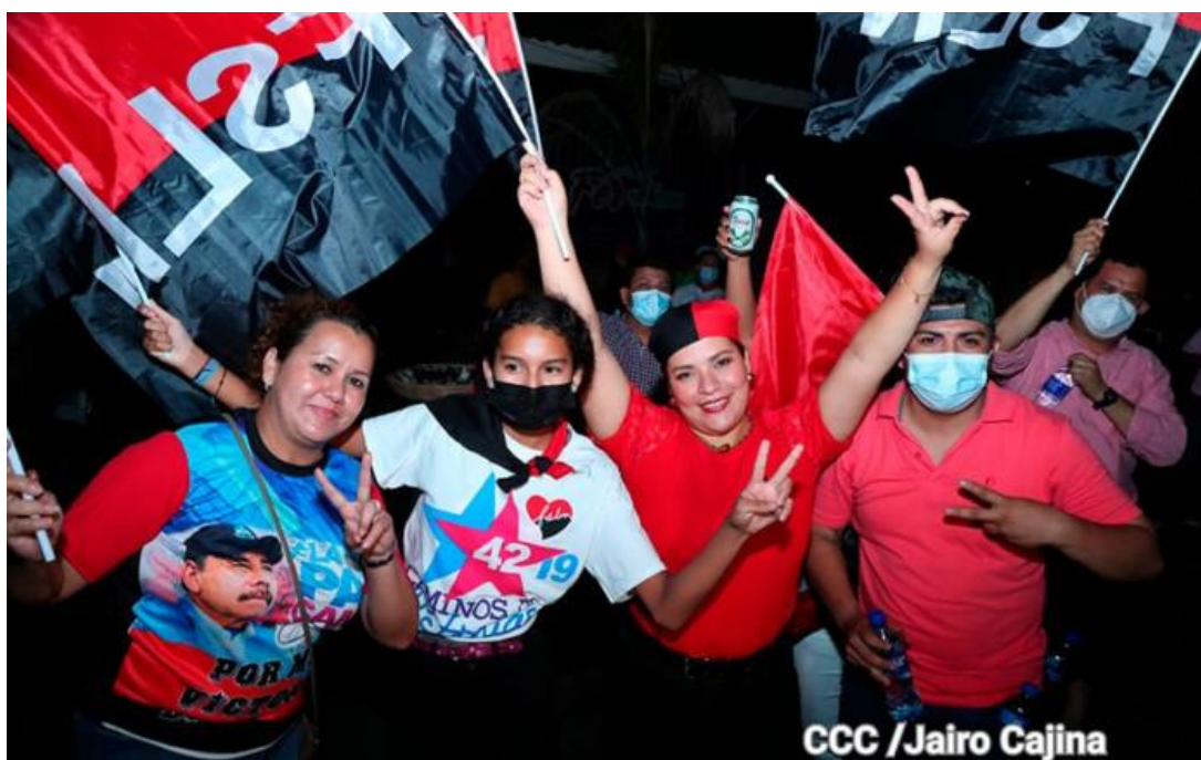
Celebration following Sandinista election victory.

The 232 international companions from 27 countries observed peaceful, fair, and democratic elections in Nicaragua. Celebrations erupted all over the country when the results were announced.