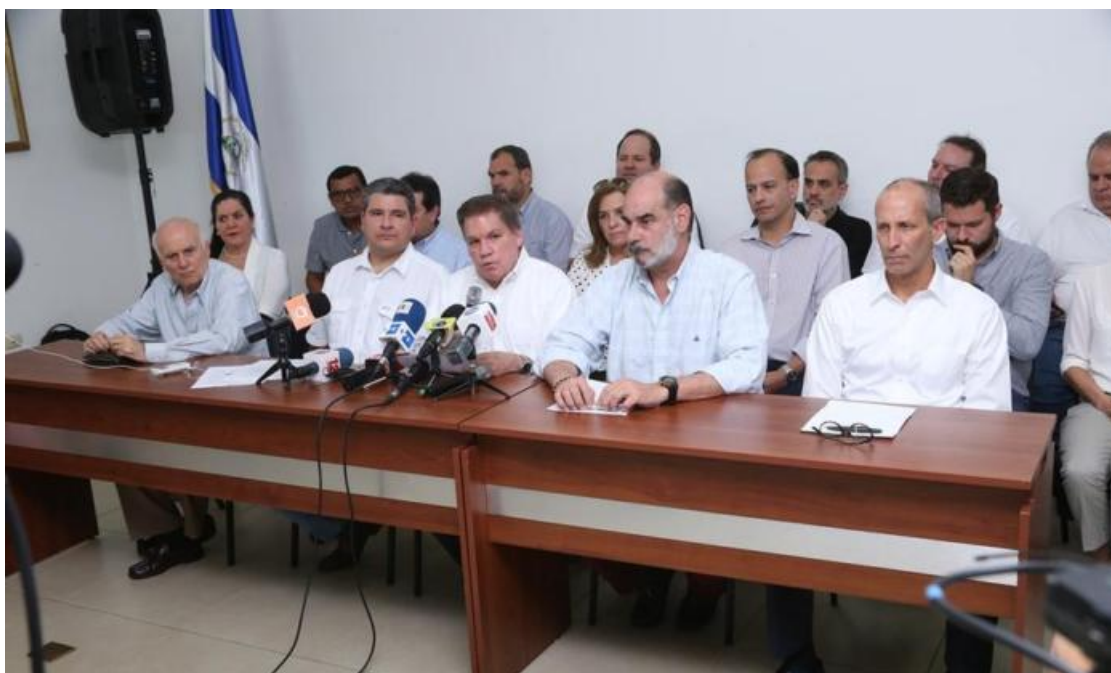
Nicaragua's business elite supported the 2018 coup attempt.

Had it succeeded, members of the COSEP would have wielded more political and economic power, hoarding even more wealth away from the Nicaraguan people. [In an opposition newspaper in Nicaragua, which is the voice of the upper-class opposition, there are renewed calls for another revuelta .]