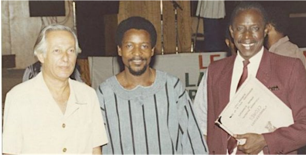
Samir Amin with African colleagues.

The 1980s were marked by the advent of International Monetary Fund (IMF) and World Bank engineered Economic Recovery Programs (ERPs) and Structural Adjustment Program (SAPs), ostensibly designed to balance current account deficits and to facilitate the repayment of loans. Nonetheless, the actual impact of these policies served further to arrest the genuine development of African societies placing them in perpetual subservience to the leading capitalist economies.