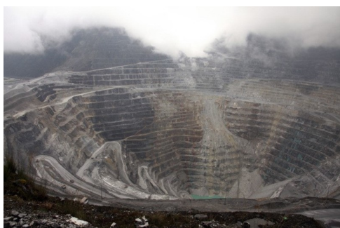
Freeport's Grasberg mine in West Papua.

For example, much has been made of Indonesia’s democratization since the fall of Suharto in May 1998, and the implementation of electoral reforms from 1999 onward. However, democratic reforms have had a limited reach in West Papua. For example, in 2003, the province of Papua was divided into two, “Papua” and “West Papua”, by the central government, contrary to local wishes and national law. Local Papuan political parties are banned 6 . The Freeport mine (see Figure 3), controlled by an American company that pays huge royalties and taxes to Jakarta, exploits West Papuan natural resources, wreaks havoc on the environment and local communities, yet yields negligible benefits to Papuan people 7 .