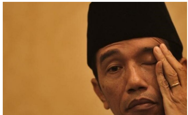
Indonesia's President Joko Widodo