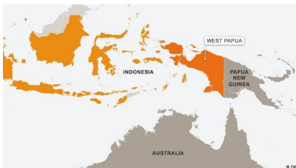
Map showing West Papua on the island of New Guinea in relation to Australia and Indonesia.

However by forging digital activist networks locally and internationally—including building West Papuan-indigenous Australian partnerships, West Papuans are participating in a grassroots democratization process with global outreach, refusing to be sacrificed on the altar of regional realpolitik. The article concludes with a cautionary account of an apparent attempt by an opportunistic Australian political movement to hijack West Papuan democratization for its own ends, a threat West Papuan and Australian civil society activists are currently moving to contain.