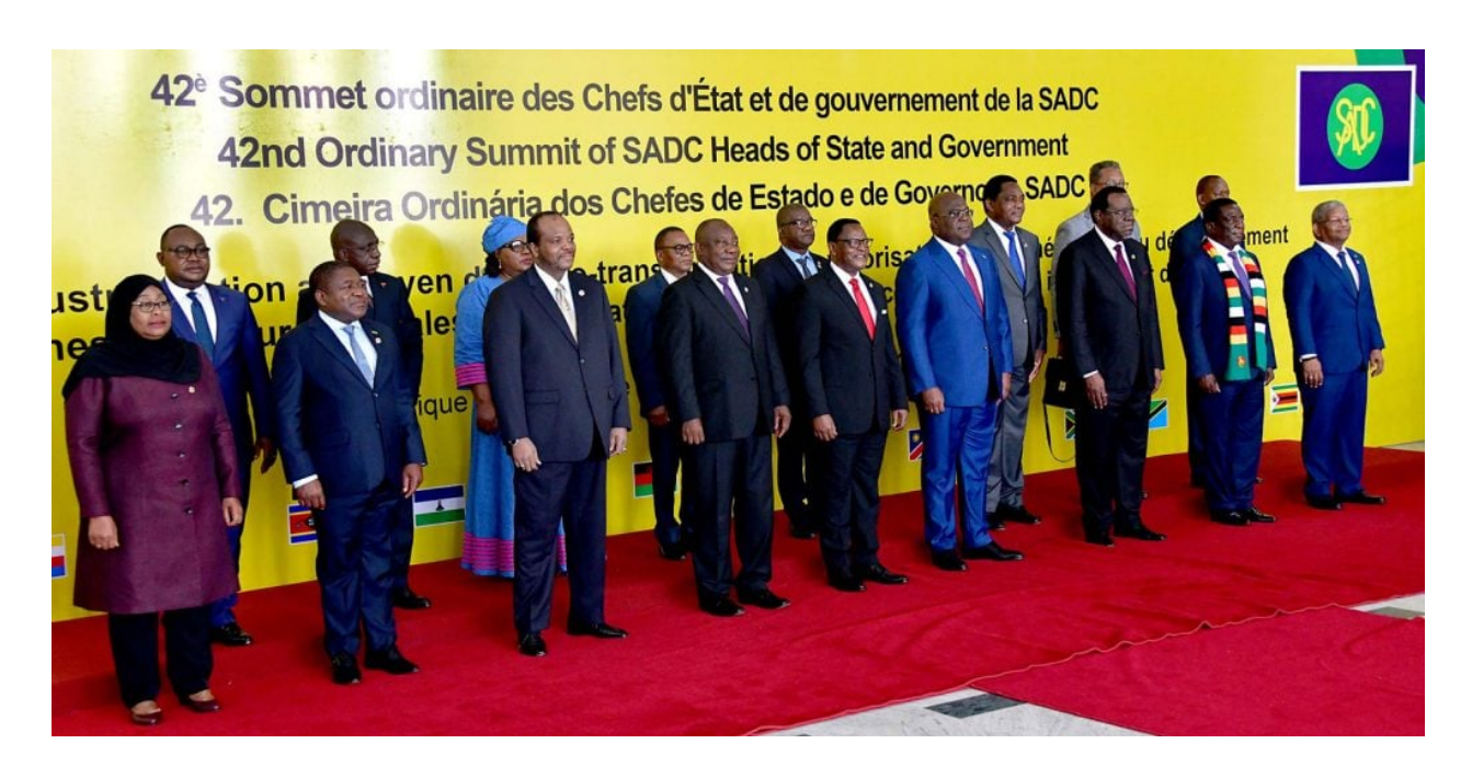
SADC leaders convene in DRC

Many member-states of the SADC were leaders within the national liberation movements turned political parties which won state power through protracted armed and mass struggles. Since 1980, when its predecessor, the Southern African Development Coordination Conference (SADCC) was formed, the regional federation has fostered economic and diplomatic cooperation throughout the sub-continent and beyond. Thirty years ago in August 1992, the SADC transformed into its present structures during a summit meeting in the newly independent Republic of Namibia.