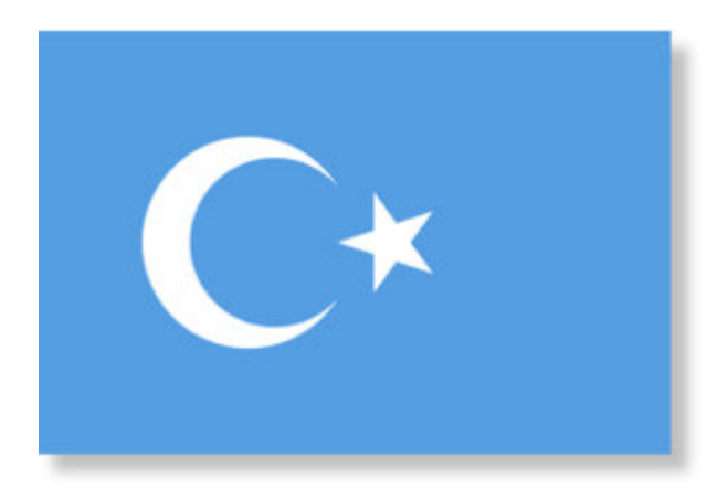
The flag of 'East Turkestan' (Xinjiang, Western China)

The paramilitary wing of the MHP (today the third largest political party in Turkey) is called the 'Grey Wolves'. In the 1960s, Turkes established over 100 camps across Turkey where members received ideological and paramilitary training from CIA agents, including one former Nazi SS member. This system was analogous to the hundreds of 'madrassas' established with CIA money for the training of jihadi extremists in Afghanistan and elsewhere. Often masquerading as 'cultural' or 'sports' organizations, the Grey Wolves in Turkey carried outshootings and bombings against left-wing and liberal activists, journalists, judges, Kurds and anyone else who was deemed a threat to US control over Turkey. Over 6,000 people were killed.