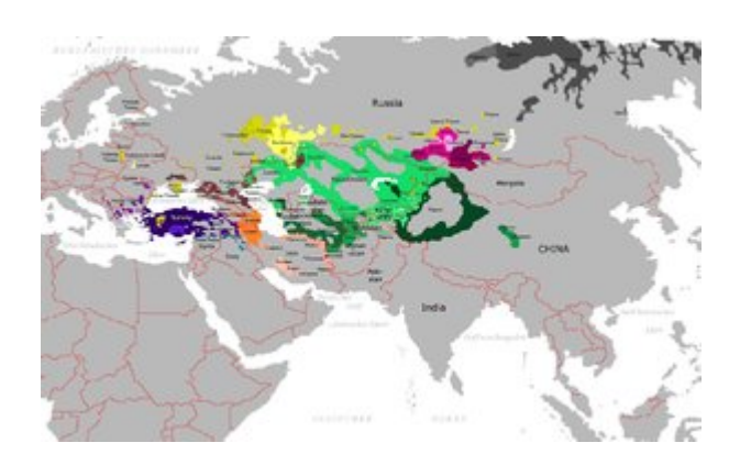
A map of 'Turkic peoples', a diverse collection of ethnicities spanning central Eurasia, is very useful for predicting the focus of US foreign policy

Having infiltrated the Turkish civilian and military intelligence establishments, the CIA then sought to co-opt Turkish political and civilian life also. In the 1960s, under US direction, one of the above-mentioned 16 soldiers, Alparslan Turkes, established the 'civilian' Associations for Struggling with Communism , and funded the far-right National Movement Party (MHP). The National Movement Party espoused a fanatical pan-Turkic ideology that called for reclaiming large sections of the Soviet Union under the flag of a reborn Turkish empire. This ideology was, of course, perfectly matched with the US 'cold war' ideology aimed at attacking the Soviet Union, and the CIA clearly were interested in promoting it, although their job was relatively easy given that Turkes and his cohorts had also been enthusiastic supporters of Hitler during World War II, who had also attempted to undermine Soviet unity under the flag of Pan-Turkism.