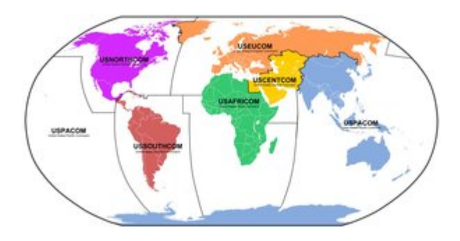
Not an empire though

Apart from the few overt US military forays (Korea, Vietnam, the odd turkey shoot in Latin America) the Empire relied primarily on covert operations to expand its control. In Western Europe – a prized piece on the 'grand chessboard' – the US Empire established 'stay-behind' networks made up of paramilitary groups from various backgrounds and espousing rightwing, fascistic ideologies. The rationale for 'mining' Europe with weapons caches and nutjobs trained in sabotage and bloody mayhem was that, in the event of a Soviet invasion and occupation of Europe, 'resistance fighters' would form the West's front-line in the coming war with the Soviets.