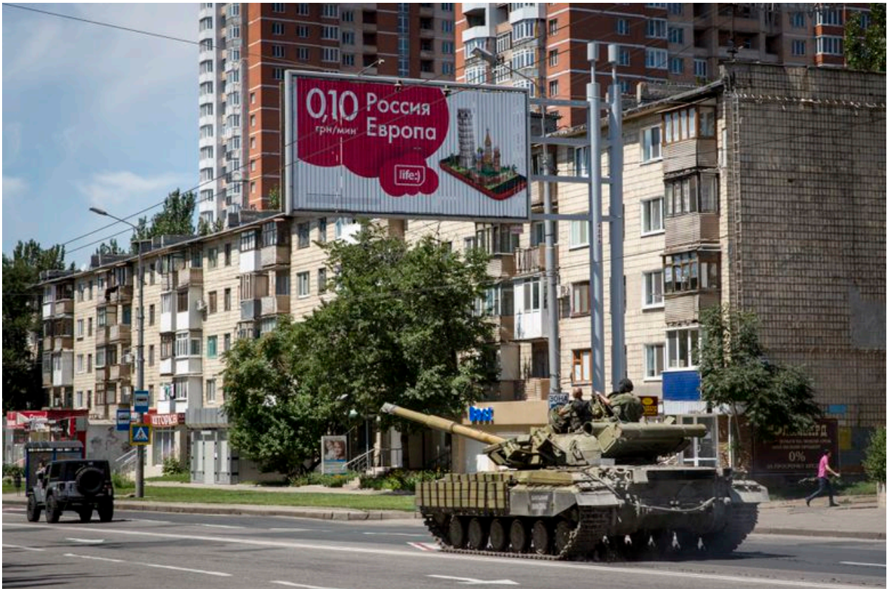
Rebels operate a tank in eastern Ukraine

Yet the evidence confirms that in the course of the last two months, the Donbass militia have acquired a significant arsenal of tanks and armored vehicles captured from Ukrainian forces.