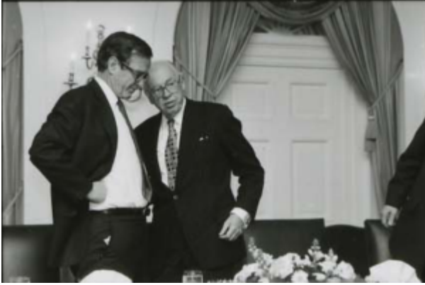
Then-Vice President George H.W. Bush with CIA Director William Casey at the White House on Feb. 11, 1981.