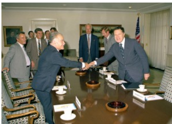
Israeli Prime Minister Yitzhak Shamir shaking hands with President Ronald Reagan’s Defense Secretary Caspar Weinberger in 1982.

However, the Madrid trip revelation and other post-investigation disclosures failed to move the needle on Official Washington’s disdain for the October Surprise story.