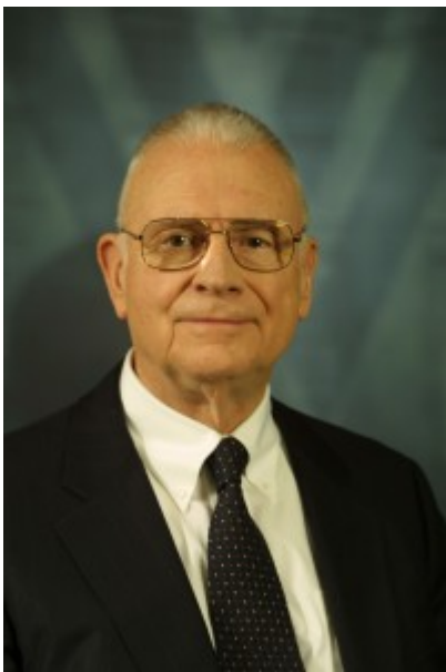
Former Rep. Lee Hamilton, D-Indiana.

But – from the start of Iran-Contra – there was a strong pushback from Republicans who didn't want to see another GOP president driven from office. There was also resistance to the scandal from many mainstream media executives who personally liked Reagan and feared a public backlash if the press played an aggressive role similar to Watergate.