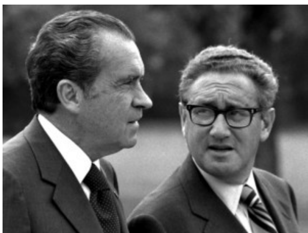
President Richard Nixon with his then-National Security Advisor Henry Kissinger in 1972.

Still, the Times and other major news outlets have failed to factor this belated admission into the larger Watergate narrative. If you understand that Nixon did sabotage President Johnson’s Vietnam War peace talks and that Nixon was aware that Johnson’s file on what LBJ called Nixon’s “treason” had disappeared from the White House, the early “Watergate tapes” from 1971 suddenly make sense.