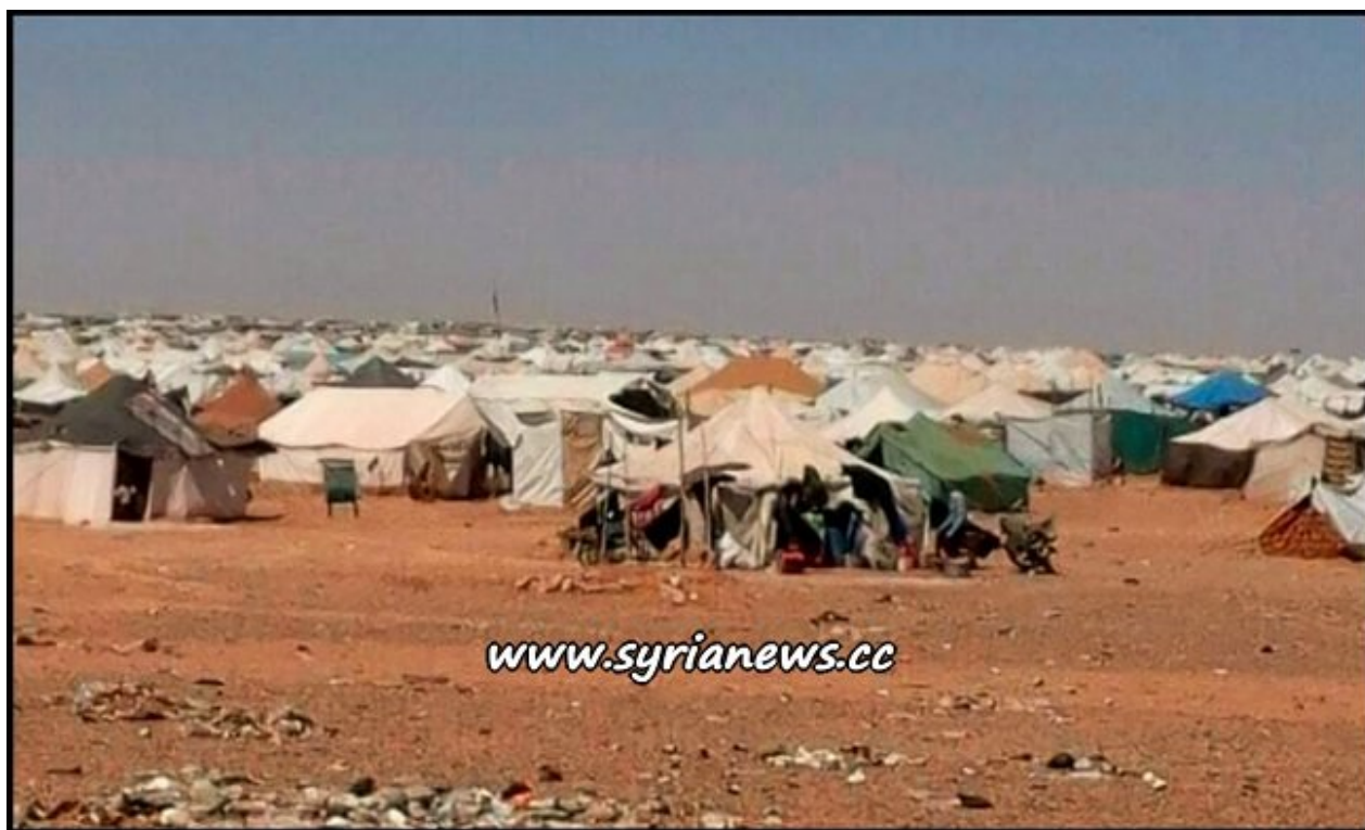
Rukban Concentration Camp for Syrian Displaced Refugees

Plans to dismantle the Rukban concentration camp were reported last October. The existence of this open air prison received massive western coverage in November, when the US finally permitted a convoy of 78 trucks filled with humanitarian aid , to safely enter. The source of the anti-Syria colonialist propaganda was "Terrorist Barbie," al Qaeda's press liaison, who omitted the facts of joint SAA, UN, & SARC convoys previously being bombed during each attempt to bring food and medicine during a 10 month period.