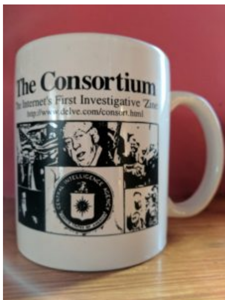
Original Consortium merchandise from 1996.

publishing. He compiled the “October Surprise X-Files” into a booklet and self-published it in January 1996.