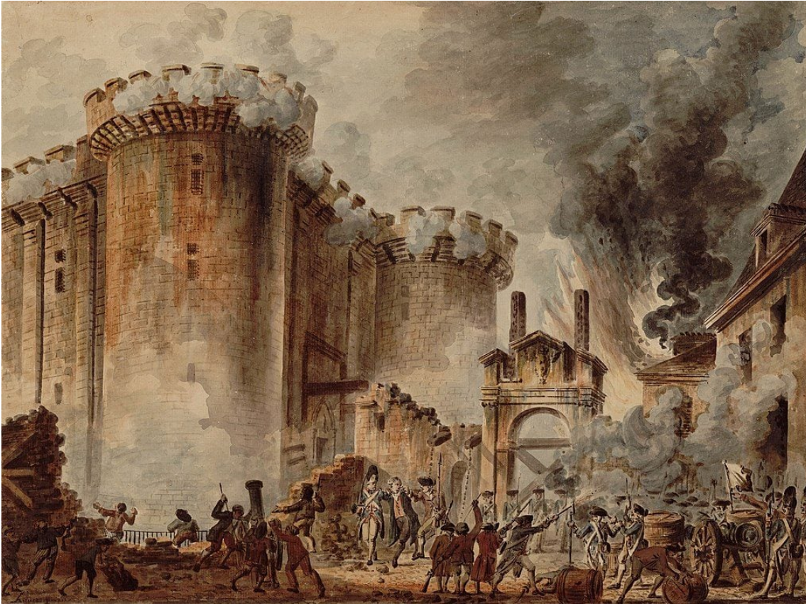
Storming of the Bastille