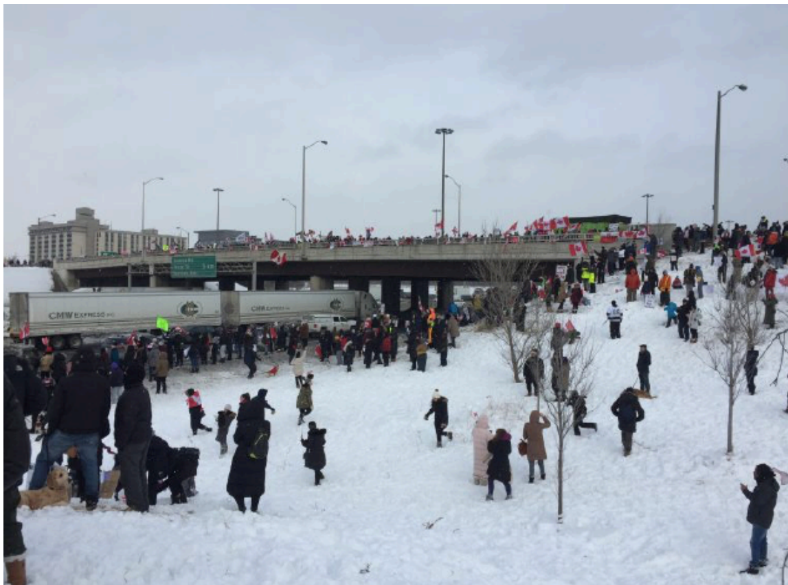
Truckers Freedom Convoy in Canada in February 2022, a movement against COVID mandates.