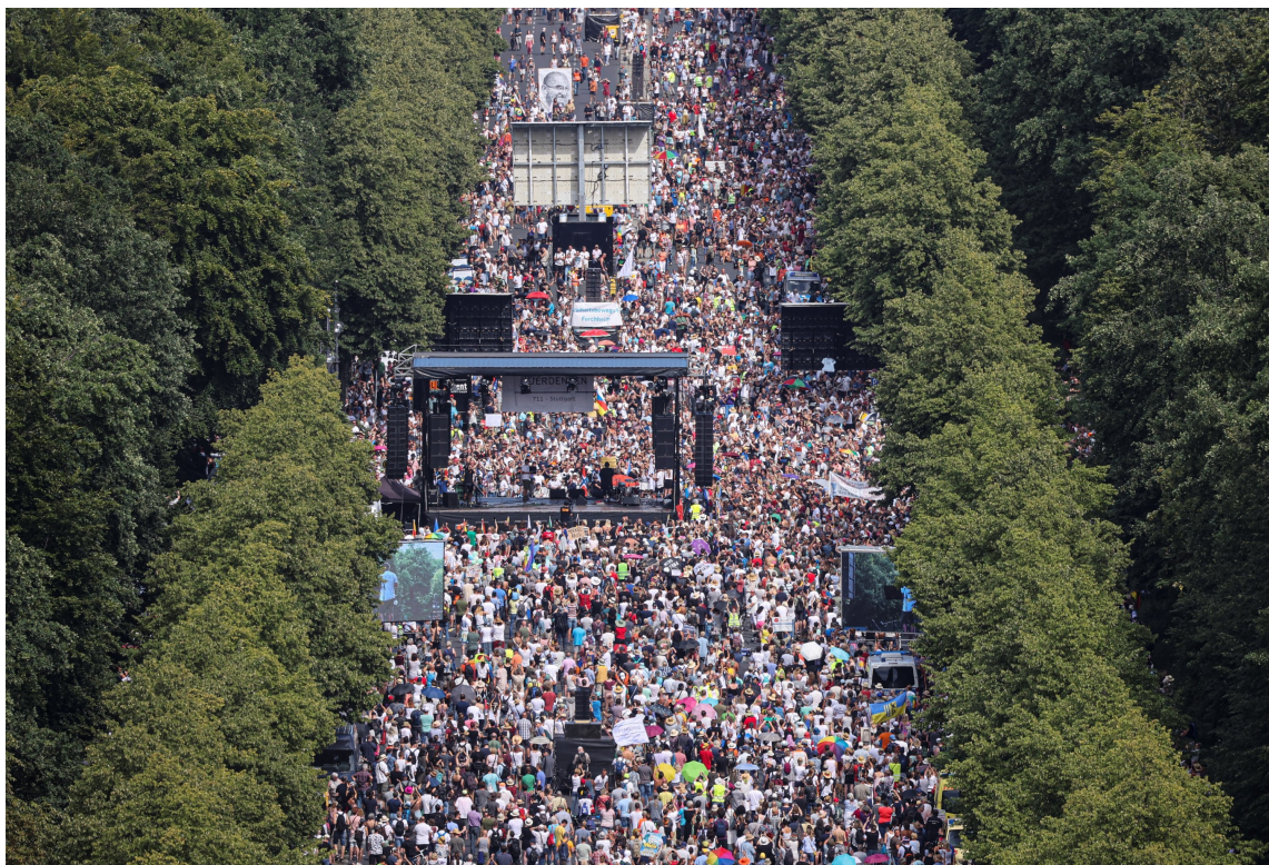
Protesters gathered near the Brandenburg Gate in Berlin in August 2020 to protest against COVID measures.

Large scale street protests will not prevail unless they are focused on effectively disabling this corrupt decision-making process.