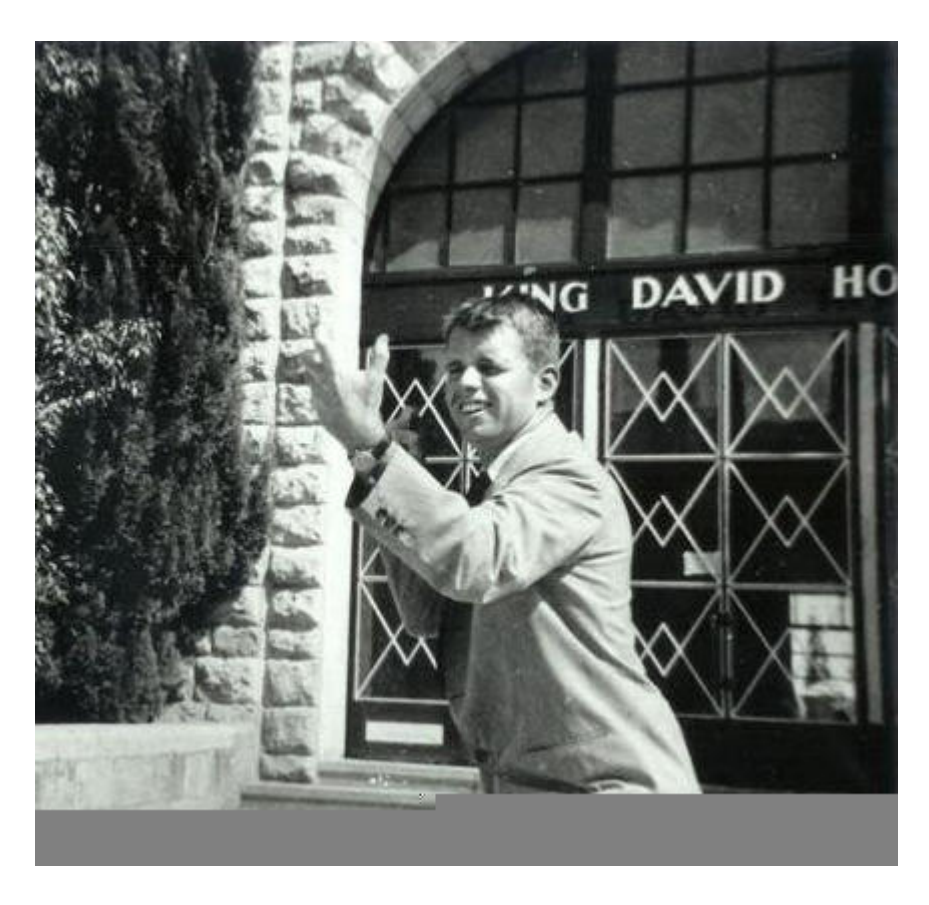
Kennedy outside of the King David Hotel striking a military pose.