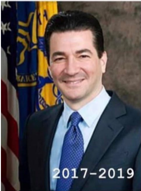
Head of FDA