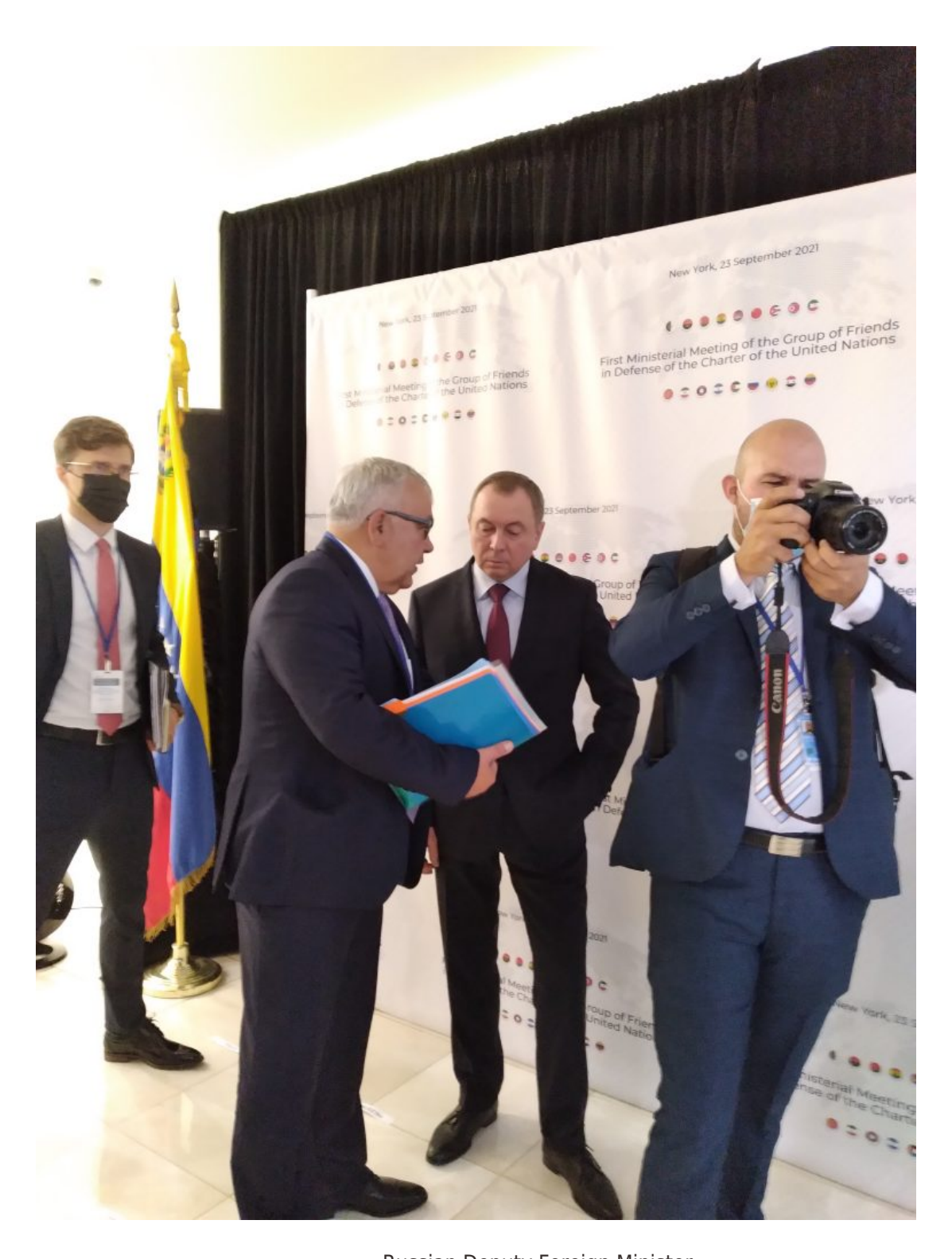
Russian Deputy Foreign Minister