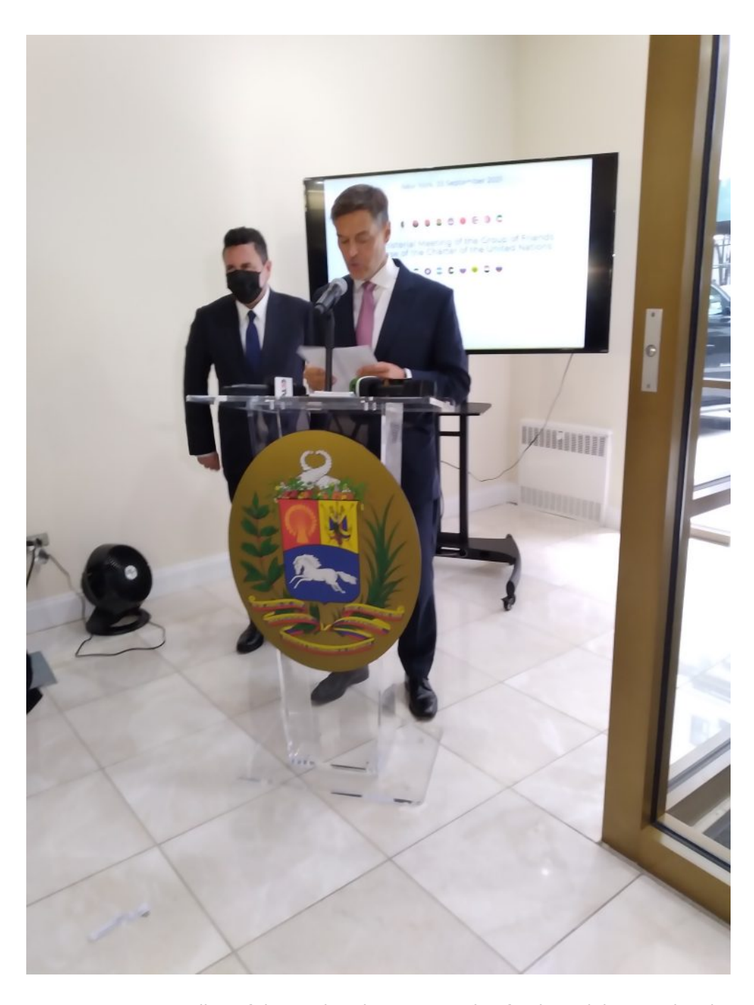
Reading of the Declaration: Venezuelan foreign minister and ambassador

Stealthily, the United Nations "Public-Private Partnerships" are increasing private corporate control of the United Nations, with the corporate "elite" partners exerting exponentially greater influence over United Nations programs, facilitating multiple methods of covertly imposing neoliberal development models through United Nations agencies often disguised as "humanitarian interventions" but indistinguishable from "color revolutions."