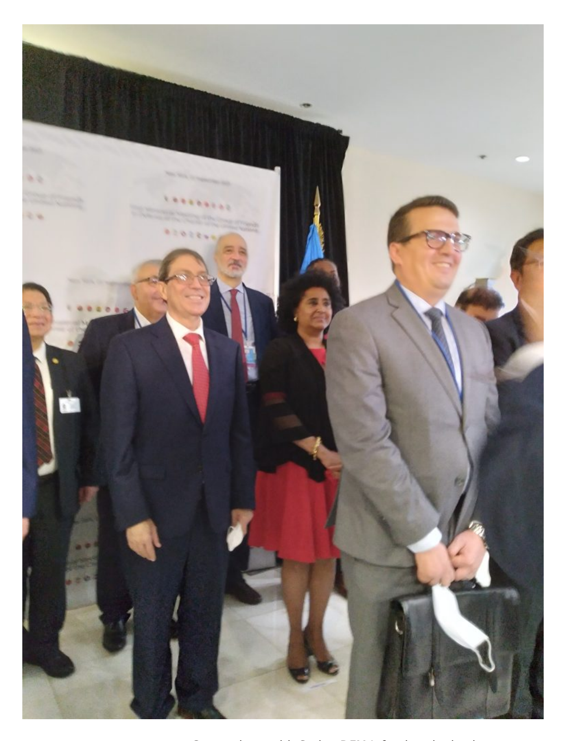
Group photo with Syrian DFM Jafaari at the back

This new "Group of Friends in Defense of the Charter of the United Nations" offers an alternative option to vulnerable targeted member states, and the inclusion of China and Russia in this new organization seeking to re-create balance in "Defense of the United Nations Charter" promises a formidable alternative of hope, and, indeed, power for the increasing number of United Nations member states threatened with subjugation by Western capitalist dominance.