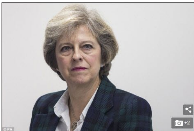
Theresa May wants to deploy an army of computerised 'mind-readers' to help her win the next Election, sources claim