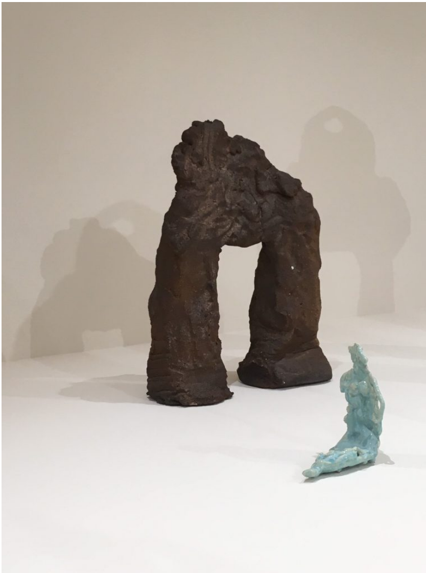
By The Road, 2006 with Sirene, 2005

Too often creations of artists originating in places we associate with conflict are interpreted as cathartic; their images seem baleful or angry, we are told, to expunge or transform painful past experience. I don't see this in Fattal's work on exhibit in this grand New York gallery. With the mostly diminutive scale of her massive (in image, not size) ceramic and clay shapes, perhaps the artist is showing us how she prevails as an energetic being celebrating a continuous forward movement.