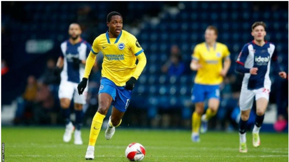
Mwepu retired from playing last year aged 24 because of a hereditary heart condition

Ex-Brighton midfielder Enock Mwepu is in hospital in Zambia after falling unwell, his former club says.