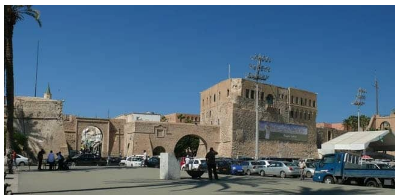
This is an unaltered photo of Green Square in Tripoli.

Watch very closely at around 1:19. Compare the architecture in this set built in Doha, Qatar, with the real Green Square pictured below.