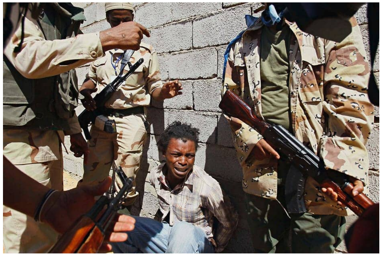
Thousands of Blacks, whether Libyans or sub-Saharan Africans, have been arrested, accused of fighting for Qaddafi as mercenaries, and lynched by rebels. This Nigerian man was arrested Sept. 17.

These African governments must be aware that Libya's ex-Minister of Justice Mustafa Jalil, leader of the Transitional Council, and other Libyan officials who have defected to the rebels were among those who condoned brutal attacks on Africans in a series of incidents a few years ago, when Nigerians and Ghanaians were being attacked in the streets of Tripoli. This was an attempt to embarrass Qaddafi and tarnish his Pan-African credentials, thereby undermining Libya's Pan-African project.