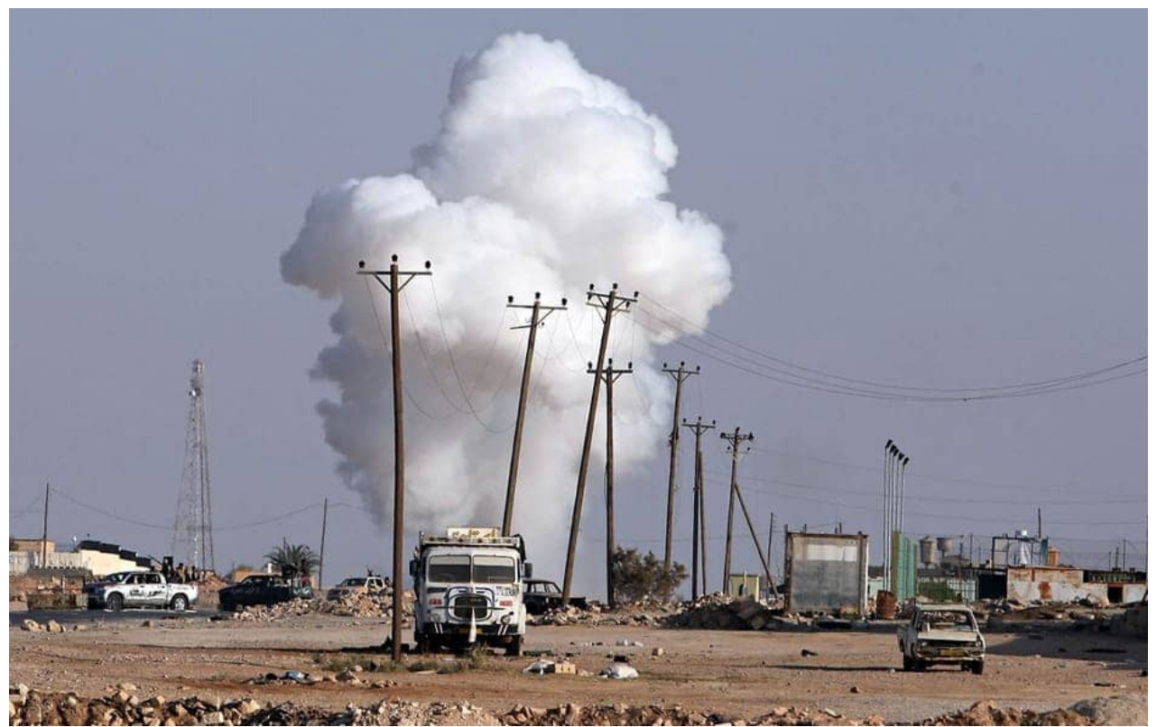
The "rebels" encounter fierce resistance in the oasis town of Bani Walid and are forced to retreat.

This war, under the banner of the U.N., has once and for all exposed this organization's fraudulent and criminal nature. On the one hand they have declared 2011 as the "International Year of People of African Descent." It is more aptly designated as the "International Year for the Destruction of Africa."