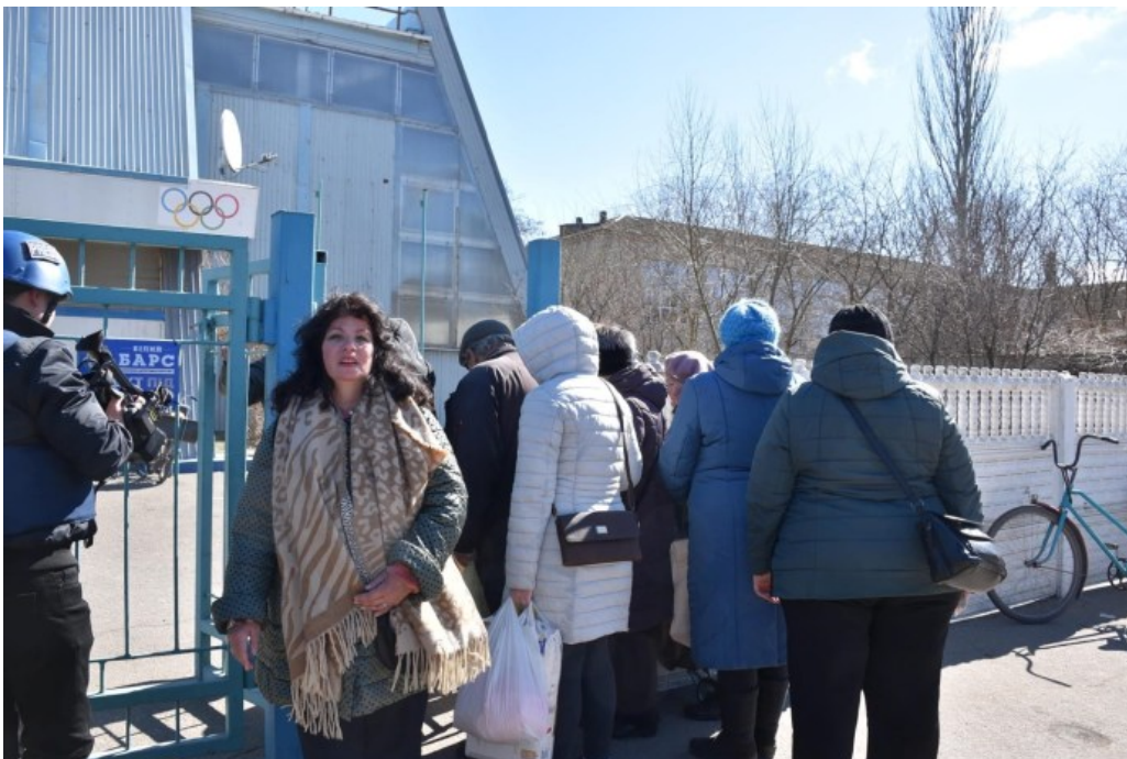
Waiting for humanitarian aid being distributed by the Russian army.