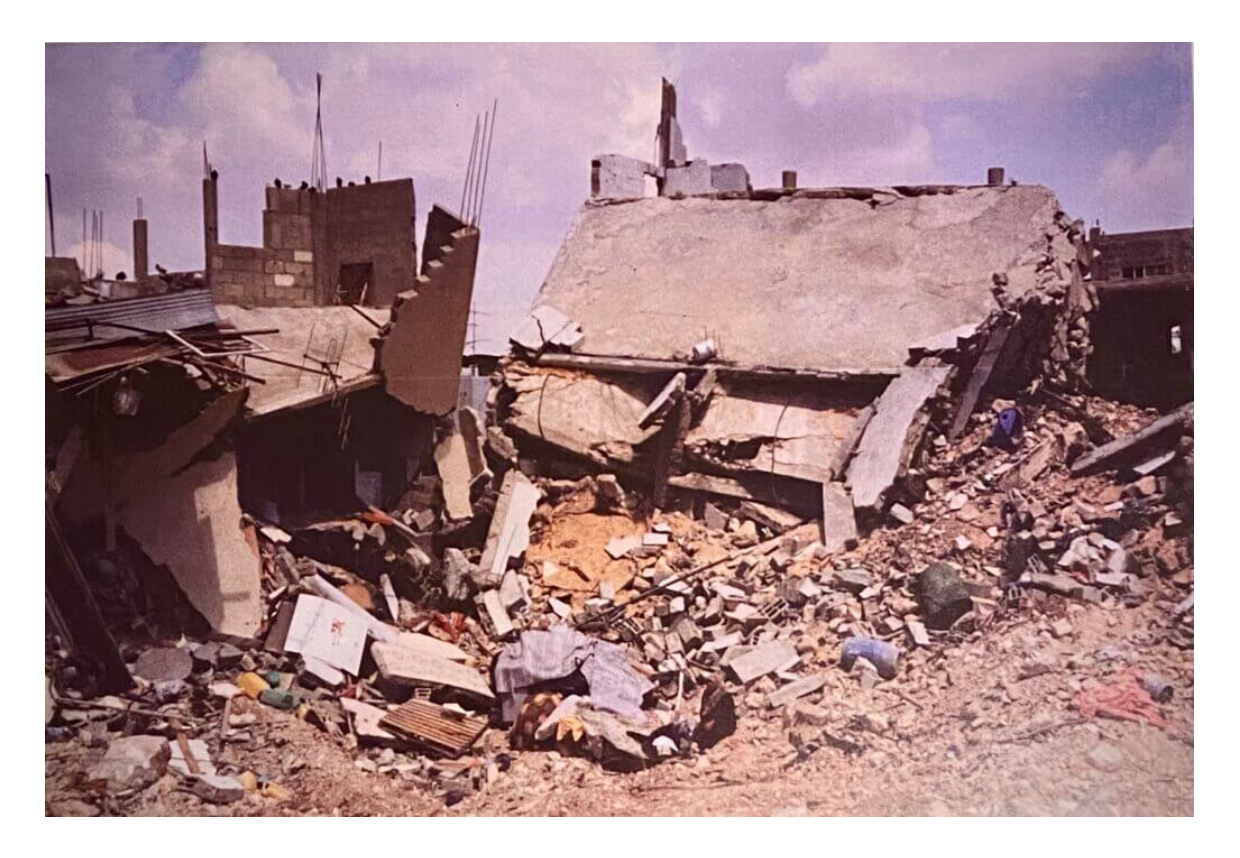
Jenin Refugee Camp After The Onslaught, April 2002.

In the aftermath, there was still no water or electricity or food available for the inhabitants because there was no camp. It had been flattened; wrecked beyond recognition. A few empty homes, their windows and doors blackened and blown out, stood empty, as if gaping in shock. More than thirteen thousand people fled the camp in terror, became refugees of the refugees. Husbands, fathers, sons, and brothers disappeared, leaving behind family members with no idea how to find them. At the end of that first day, just before twilight, a wooden shack at the edge of the camp exploded and burst into flames.