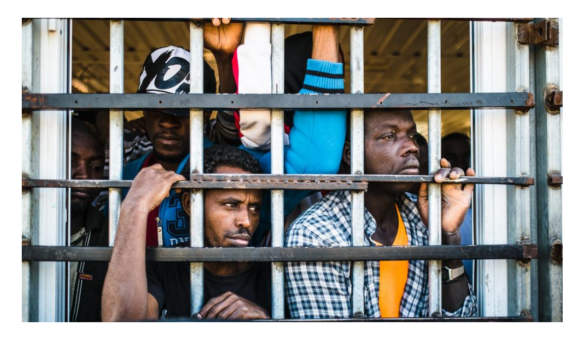
Thousands of loyalists and migrants from other African countries languish in prisons.

Libya has been transformed into a dysfunctional neo-colonial entity, where an array of militias squabble over territory and spoils. Its vast landmass has become a safe haven and training ground for ISIL and other Al-Qaeda offshoots. Thousands of Libyans and other African nationals are still detained without trial in what can only be described as concentration camps. Many have been tortured and executed in these same camps, their only crime, being Qaddafi loyalists. Those now in control of Libya hated Qaddafi's Pan-African objectives. They are Arab supremacists and are persecuting Black Libyans and other African nationals.