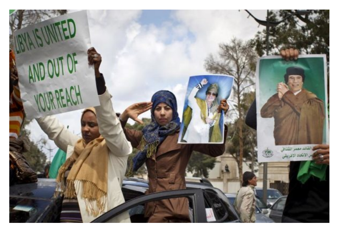
What we knew all along is now a substantiated and indisputable fact – there was never a mass uprising in Benghazi or anywhere in Libya. The Libyan people in their millions made it clear that they supported the Al-Fatah Revolution.