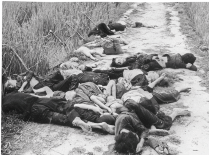
A clump of bodies on a road in South Vietnam.