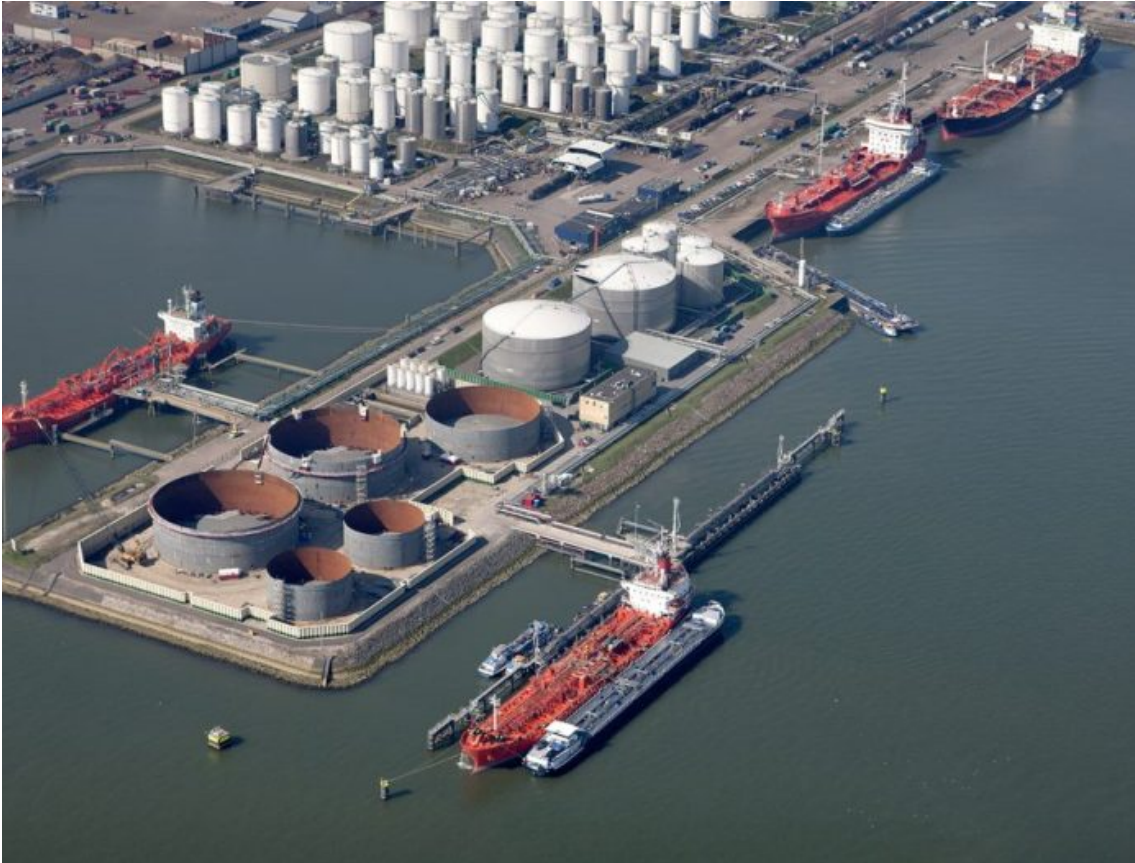
Port at Rotterdam.

Believe it or not, The Washington Post had a decent article breaking down where Russia's exports go. Of the approximately 7.2 million barrels per day Russia exports to the world, 4.8 million go to countries, most of them in Europe, that say they no longer want to buy it from there.