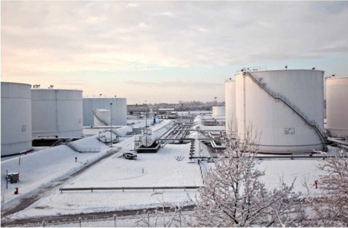
Oil storage tanks in Russia.

The oil industry in general is not geared for massive long-term storage due to supply/demand shocks because there is literally no need for it. What expands is the capacity to move oil around to consume it, not store it in big tanks hoping someone will buy it.