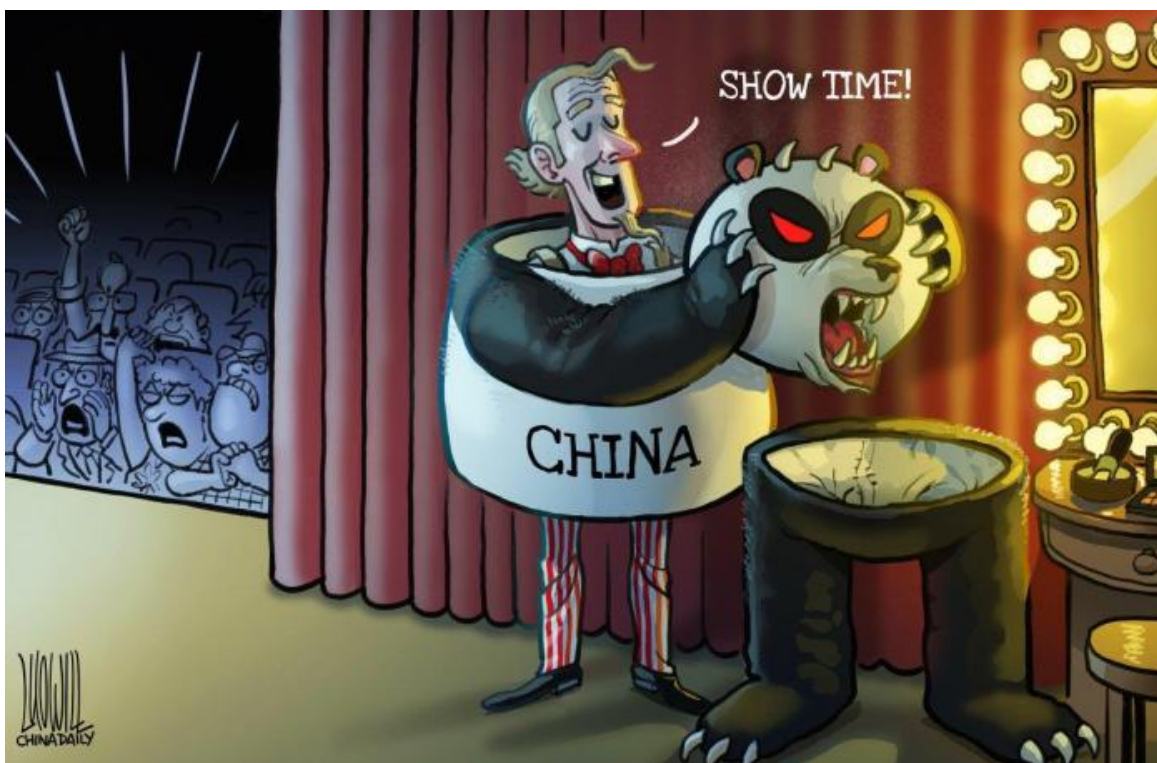
Cartoon mocking demonization of China in U.S. media.