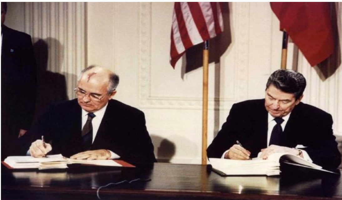
Soviet Premier Mikhail Gorbachev and U.S. President Ronald Reagan sign INF Treaty.

Despite the revitalization of the Cold War under President Ronald Reagan, McGovern says that the 1980s were a period of optimism which saw the signing of landmark treaties like the 1987 Intermediate Range Nuclear Range Forces Treaty (INF). It required the U.S. and the Soviet Union to eliminate and permanently forswear all their nuclear and conventional ground-launched ballistic and cruise missiles with ranges of 500 to 5,500 kilometers.