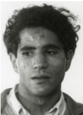
Sirhan Bishara Sirhan is the convicted assassin of United States Senator Robert F. Kennedy in 1968.

And since the CIA's shadow is all over the RFK assassination, we are left to ask if Nixon and the CIA were operating on the same page. Or was it the reverse, that Nixon and the CIA were at odds? Did the CIA remove Nixon from office with Watergate? Could the girl have been used to create a false lead to Nixon? Or was it something else again? Was it simply fortuitous that Sirhan's Palestinian Arabic origins were emphasized and that his lawyers, who in no way defended him, suggested that he was mad at RFK for supporting the sending of planes to Israel and the oppression of the Palestinians by Israel? What were Kennedy's positions vis-à-vis Israel? Who was the girl? What country had she come from when she arrived in NYC three days before?