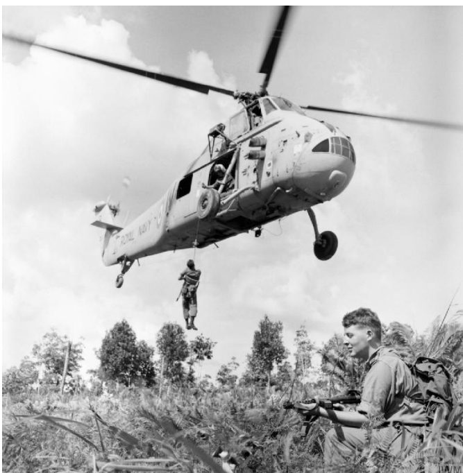
Image: While operating in Borneo during the Indonesian Confrontation, a soldier is winched up to a Westland Wessex HAS3 of 845 Naval Air Squadron, during operations in the jungle. A soldier is kneeling on the edge of the extraction zone.

(6). Egypt (1882-1956): British conquest (1882); independence but with retention of British forces (1923); British forces finally left after the coming to power of Colonel Abdul Gamal Nasser (1956); however this was immediately followed by the collusive UK, France and Apartheid Israel invasion of the Sinai Peninsula and the Suez Canal that took place at the same time as the Russian invasion of Hungary (1956); nuclear-armed, UK-backed Apartheid Israel invaded again, seizing the Gaza Strip and the Sinai Peninsula (1967); defeated by Apartheid Israel in the Yom Kippur War (1973); US-brokered peace with Apartheid Israel, and return of the Sinai Peninsula (1979).