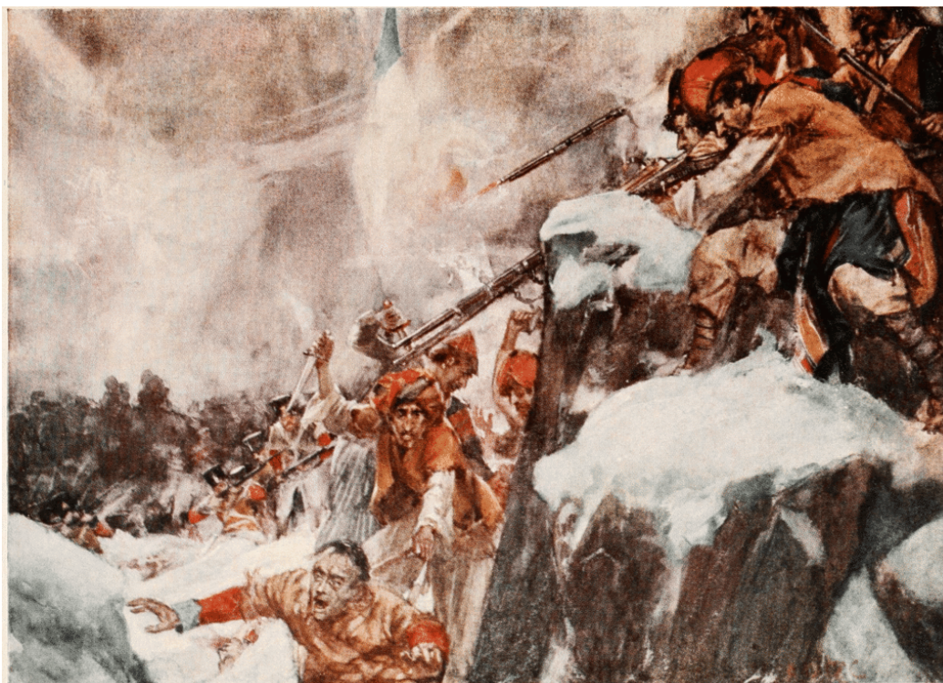
Afghan forces attacking retreating British-Indian troops

Below is a brief, alphabetically-ordered summary of the last 70 years of egregious UK violence (with the overall historical period of British intervention, and deaths from violence and imposed deprivation given in brackets). One notes that at the end of WW2 (1945), a mere 7 years before the accession of Queen Elizabeth II in 1952, the British Empire was at its peak. Most African colonies of the UK gained independence in the 1960s, and the key default reference for this list is [3] which contains a succinct history of every country.