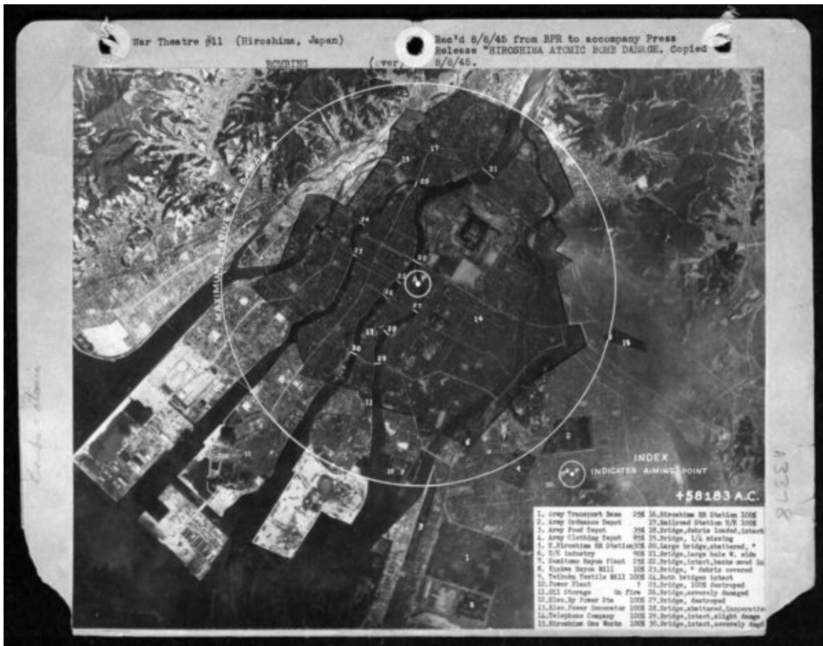
Damage map of Hiroshima, 8/8/1945.

The Japanese also began to talk about the bomb damage for the first time in their newspapers, as the survey team sent to Hiroshima by the Japanese high command had finally sent its report back. (Someday I will write something here on this — it is its own interesting topic.) American newspapers on August 8 and 9th were reporting huge casualties: “Atom Bomb Destroyed 60% of Hiroshima; Pictures Show 4 Square Miles of City Gone” ( New York Herald Tribune , 8 August); “200,000 Believed Dead in Inferno That Vaporized City of Hiroshima” ( Boston Globe , 9 August). This latter estimate of the dead too high — it was created by just assuming 60% of the Hiroshima population were killed, as opposed to 60% of the area destroyed. But this is the sort of estimate that would persist until full surveys, by the Japanese and Americans, were done in the postwar.