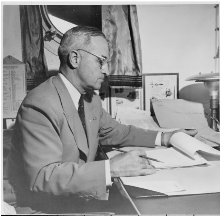
“President Harry S. Truman at his desk aboard the U. S. S. Augusta, returning from the Potsdam Conference. He is preparing his “report to the nation.” August 6, 1945.”

When Truman says he “ made the first draft on the ship coming back ,” he’s referring to his travel back from Europe aboard the USS Augusta . In fact, there is a photograph in the Truman Library that claims to be showing him writing this very draft: