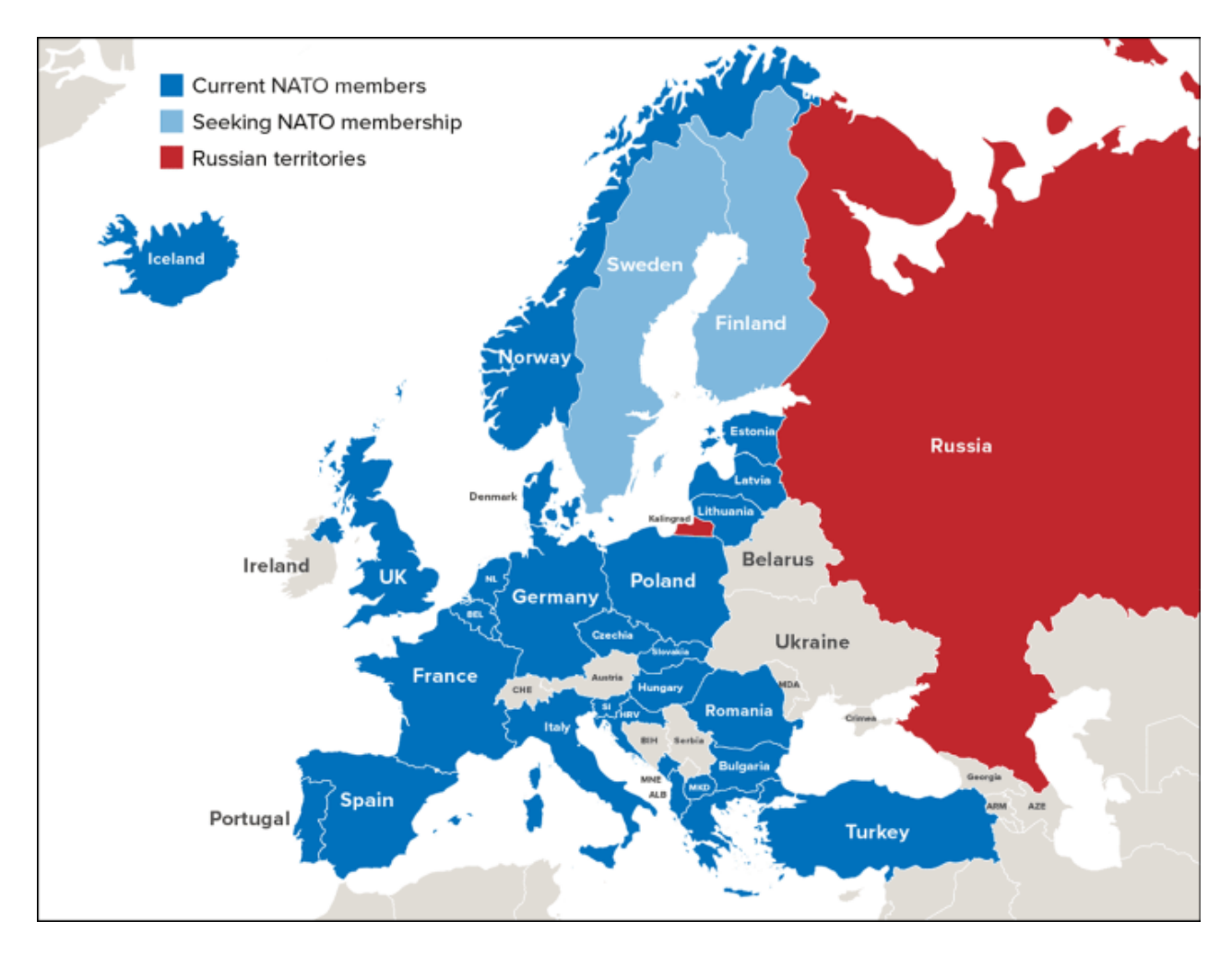
Europa 2022.