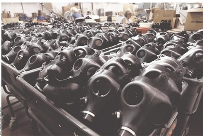
Police say Israelis are crowding gas-mask distribution facilities, readying for possible retaliation after any strike on Syria. Above, an Israeli mask factory.

DJIA 14840.95 ▲ 16.44 0.1% NASDAQ 3620.30 ▲ 0.8% NIKKEI 13459.71 ▲ 0.9% STOXX600 300.13 ▲ 0.8% 10-YR. TREAS. ▲ 7/32, yield 2.756% OIL $103.80 ▼ $1.30 GOLD $1,412.90 ▼ $5.70 EURO $1.3241 YEN 98.35