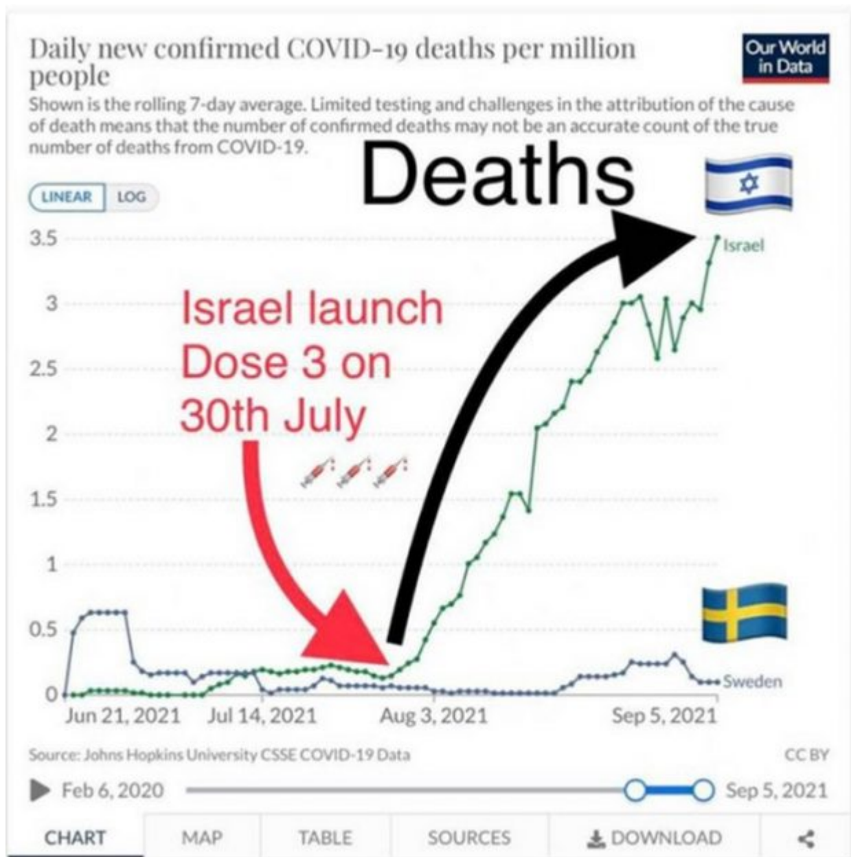
Chart from Citizen Free Press

Below is a graphic based on data from John Hopkins University that shows a sharp rise in Covid deaths after the booster was introduced in Israel at the end of July.