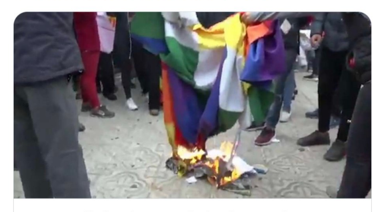
En Bolivie, le « wiphala », drapeau des indigènes est attaqué après... nouvelobs.com

nouvelobs.com/monde/20191112... via @LObs Je suis indigné par le coup d'état contre @evoespueblo et inquiet des dérives contre les #autochtones et les #socialistes. #democratie #Bolivie #NPD