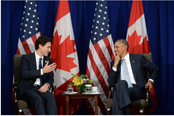
Trudeau and Obama in Ottawa (file picture)

Here is the only SOLUTION – and YOU can help change history and bring prosperity and financial sovereignty back to the Canadian people.